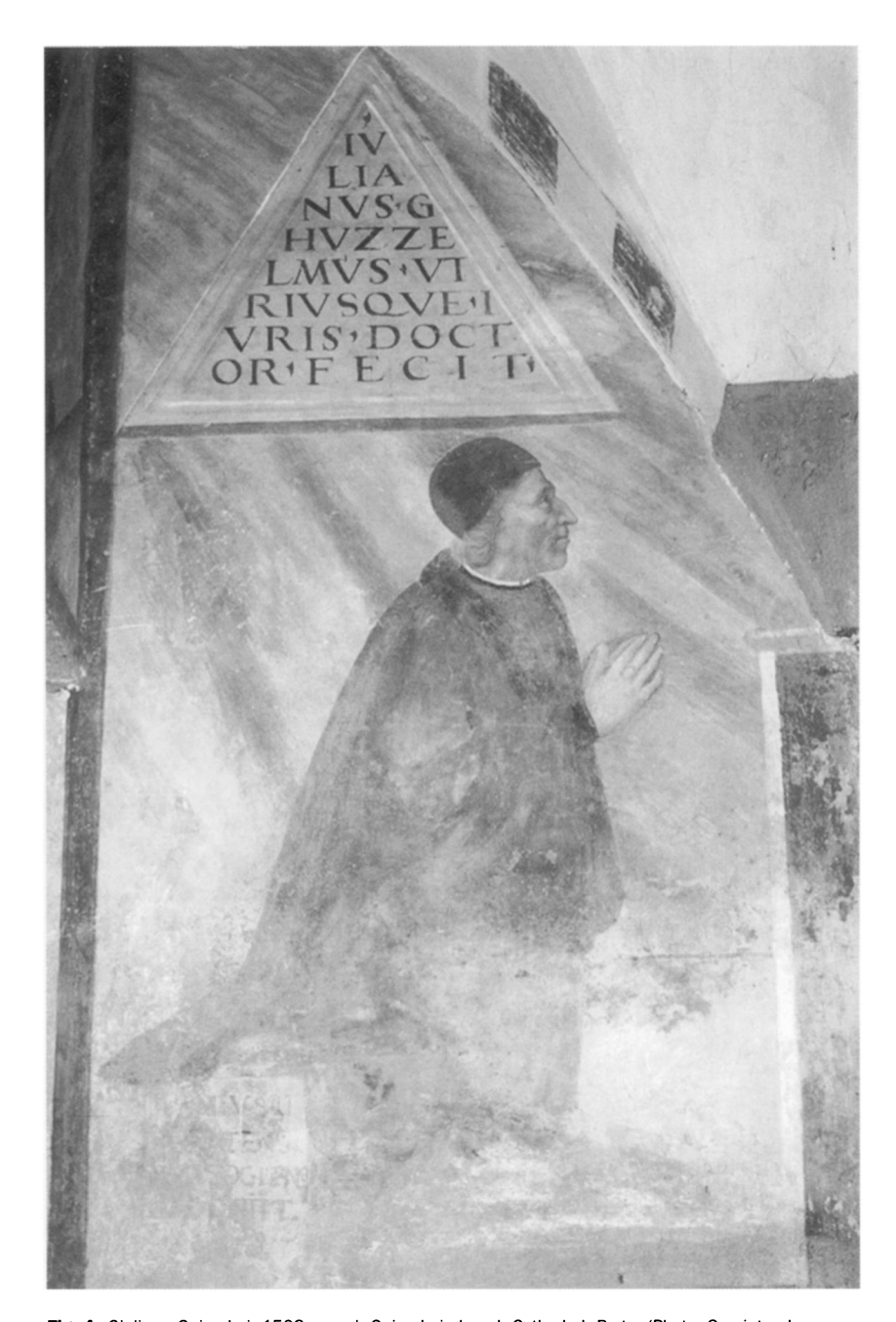
Fig. 4. Giuliano Guizzelmi, 1508, mural, Guizzelmi chapel, Cathedral, Prato.

babies are, in any case, notoriously difficult to achieve and there is no reason to suspect that the image of Lactantio was anything other than a generic image of a swaddled baby. Yet the image clearly fulfilled its role in the context of Guizzelmi's vow.