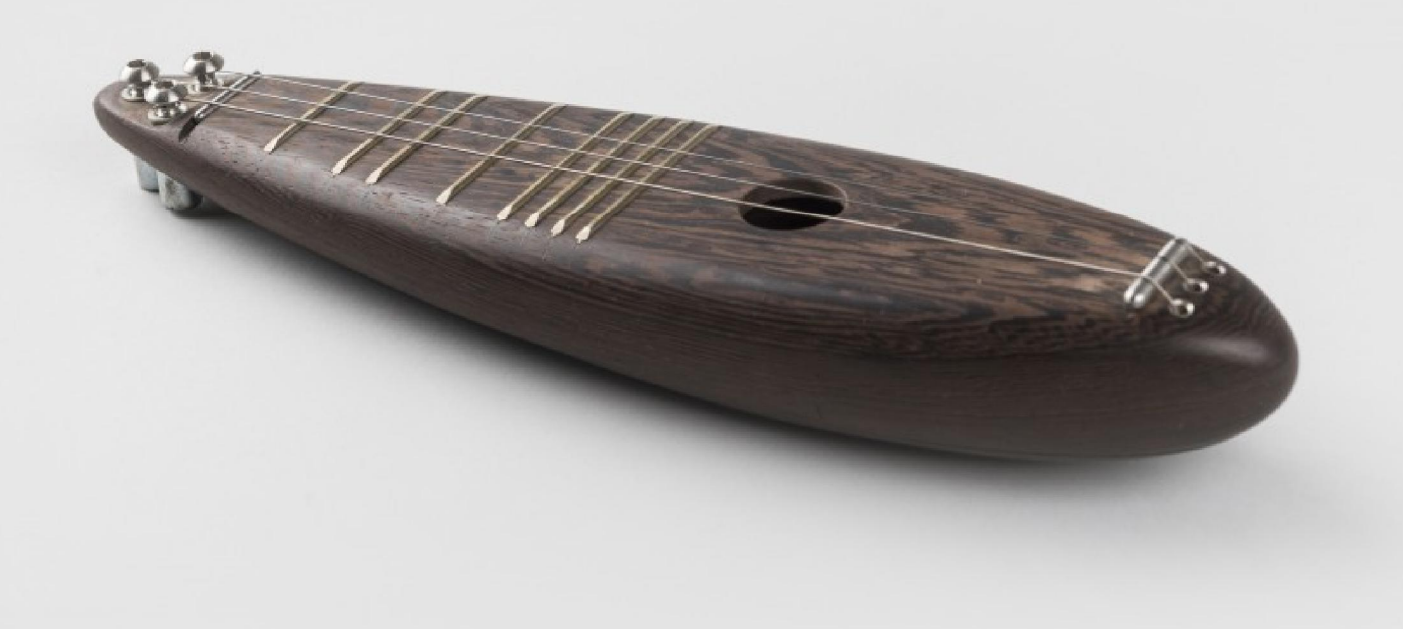
HW 2 – Write a made-up label (45 word limit) ČUDO (SMD)