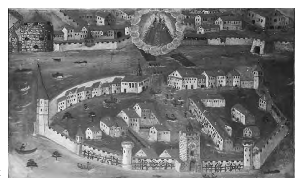
Figure 2: Painting of the Flood of Solothurn 1651. On display in the Spitalkirche zum Heiligen Geist, Solothurn, Switzerland.

in escape from a situation of individual or collective emergency.<sup>44</sup> An ex-voto may be a painting, medal, or even a football shirt that is exhibited in a public space, often in a church. Figure 2 shows a painting commissioned in memory of a dramatic flood in the town of Solothurn (western Switzerland) on 30 November 1651. At that time, the waters of the Aare River carried a huge amount of driftwood which jammed at the bridge, damming the water and diverting it into the town. In despair, the frightened citizens vowed to recognize the help of Virgin Mary if the town was spared. Subsequently, the bridge collapsed and the water level within the town decreased. Today, this ex-voto is on display in a local church.<sup>45</sup>