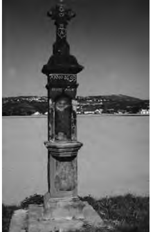
Figure 4: The "hail memorial" in the urban district of Kripp (in Remagen, Rhineland-Palatinate, Germany).