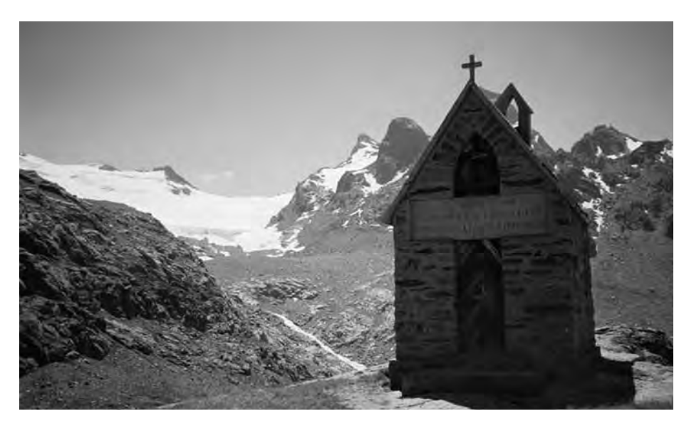
Figure 3: Chapel Lake Ruitor, built 1606.

Italian Alpine Club in 1880.<sup>46</sup> At the climax of the second major phase of the Little Ice Age in the 1590s, the advance of the nearby glacier led to annually recurring floods which lasted for almost a decade. The imminence of the advancing glacier was first noticed in 1594, when a wall of water from the lake destroyed houses, barns, forests, and meadows on its way down to La Thuile. A disaster of similar magnitude occurred the following year. The recurrence of the flooding upset the political authorities of the Duchy of Aosta. During the years that followed, they tried to find a technical solution to the problem by having an "engineer" construct a tunnel to evacuate water from the lake. However, this project ultimately failed for technical reasons. In 1603, efforts to prevent the floods by technical means were abandoned. Instead, it was decided to build a chapel near the lake in order to halt the further advance of the glacier. The chapel, dedicated to Santa Margherita, became the destination of a procession to the lake each year on 20 July which contributed to the renewal of the memory of the flood disasters.<sup>47</sup>