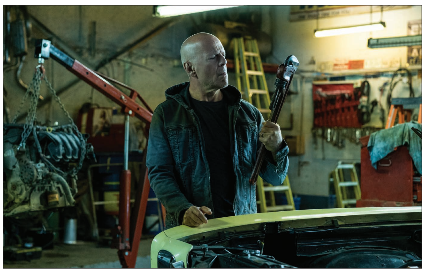
Death Wish (2018). Directed by Eli Roth. Shown: Bruce Willis.

The contemporary vigilante film prescribes a very similar solution to the problems facing the United States, looking to harness the rage of the emotionally wounded white male to return the nation to stability. As sociologist Michael Kimmel suggests, men in the contemporary moment feel a sense of "aggrieved entitlement," a state of permanent dysfunction whereby they resist an inevitable future of racial and gender equality (Angry White Men 18). The structure and style of these films construct older white men as besieged victims, "protecting white women and the traditional family from rapacious sexual predators and protecting a distinctly American vision of masculinity—the Self-Made Man" (Kimmel, Manhood in America 254). It is these men who formed the base of Trump's support during his run for the presidency in 2016: middle-class, Republican white men who feel "disenfranchised" and "cut out of the American Dream" (Thompson). The rhetoric Trump employed through his campaign and during his presidency appeals directly to the fears and con-