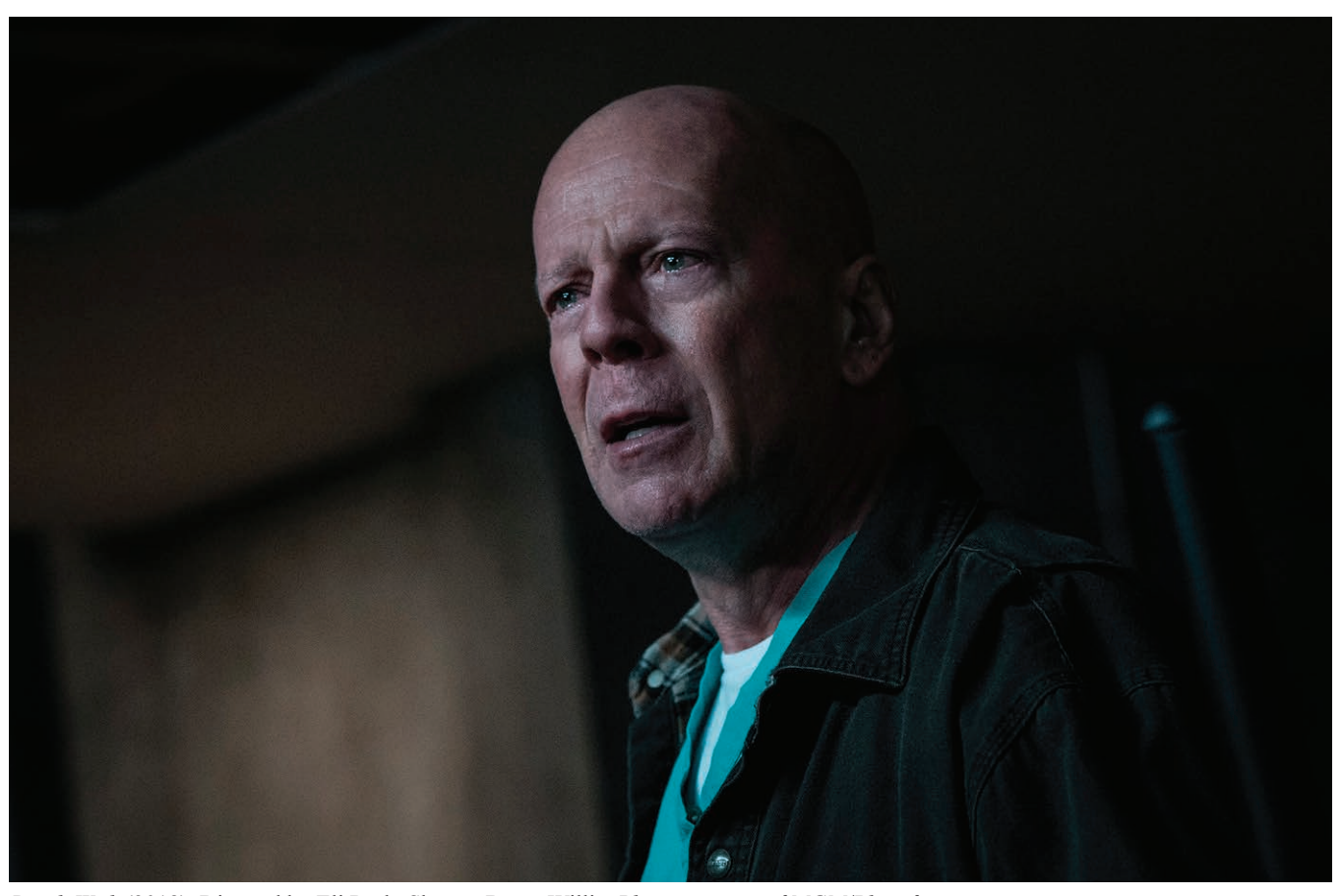
Death Wish (2018). Directed by Eli Roth. Shown: Bruce Willis.