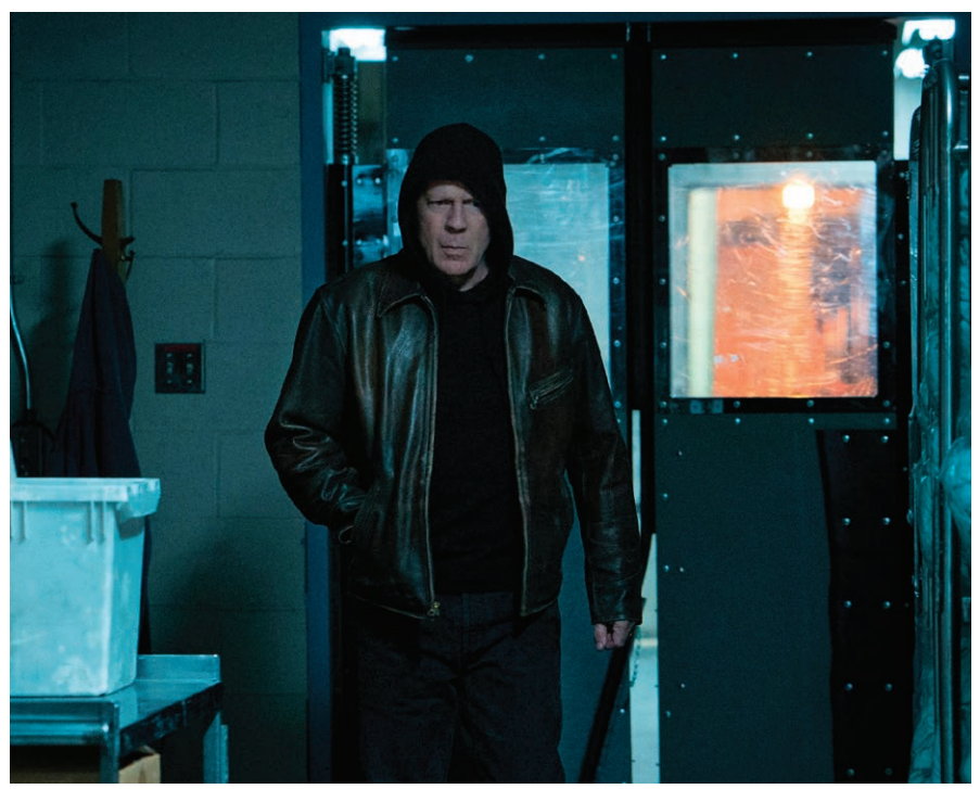
Death Wish (2018). Directed by Eli Roth. Shown: Bruce Willis.