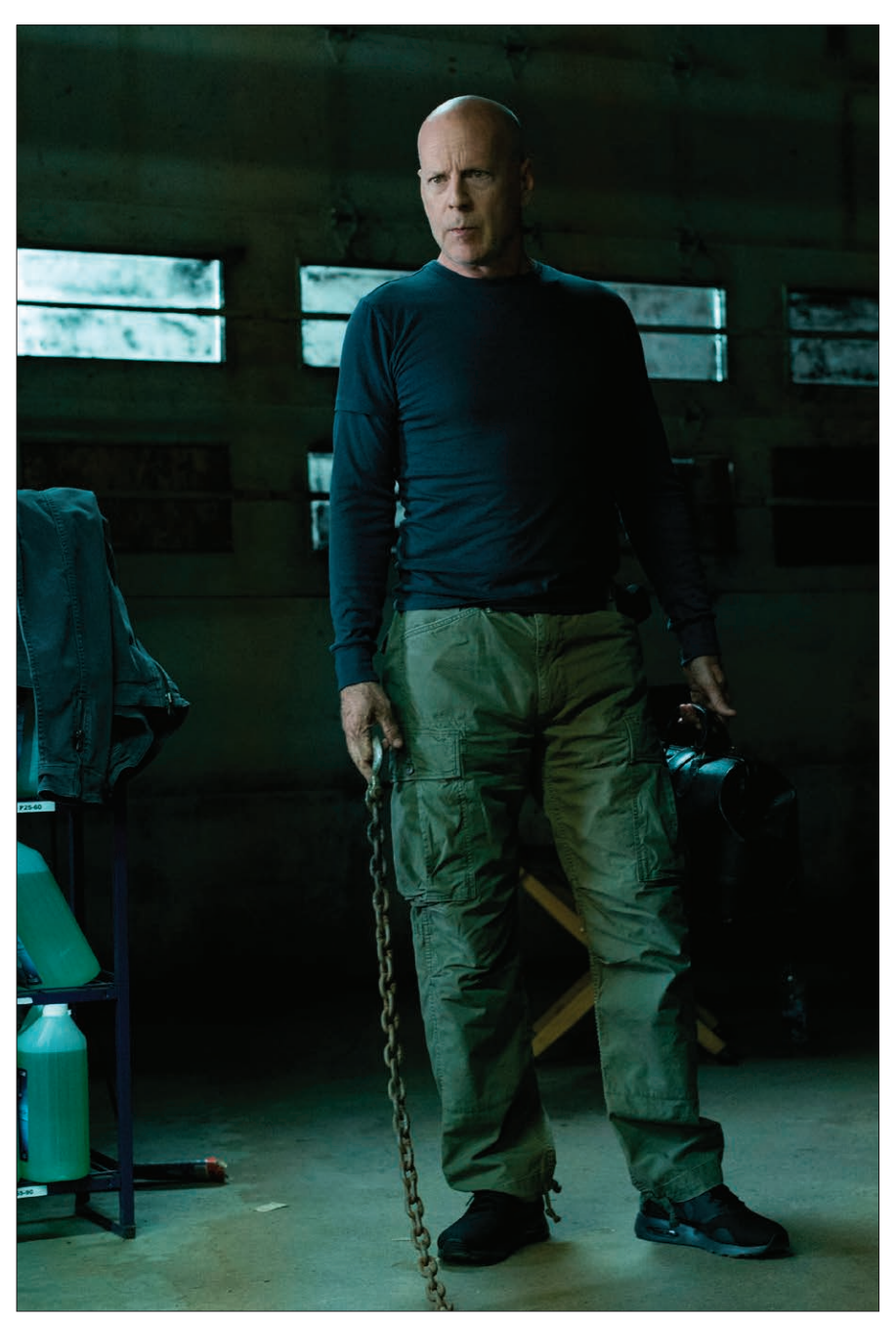
Death Wish (2018). Directed by Eli Roth. Shown: Bruce Willis.

vigilante genre as a whole is thriving, but in the guise of the superhero film. Presenting the defeat of mortal threats to humanity and the resolution of social and environmental catastrophes as contingent on the benign intervention of (super)heroic individuals, these films have become the more family-friendly, acceptable face of the vigilante movie: more cooperative ( The Avengers [Joss Whedon 2012]), increasingly inclu-