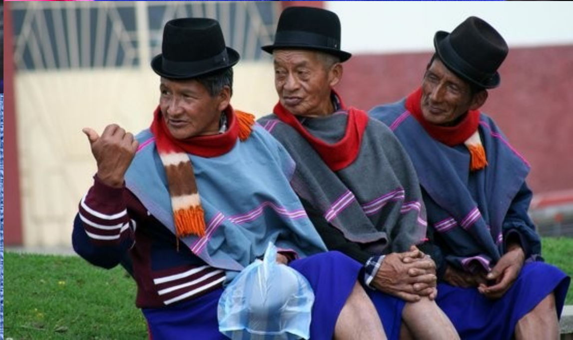
People of the Misak tribe