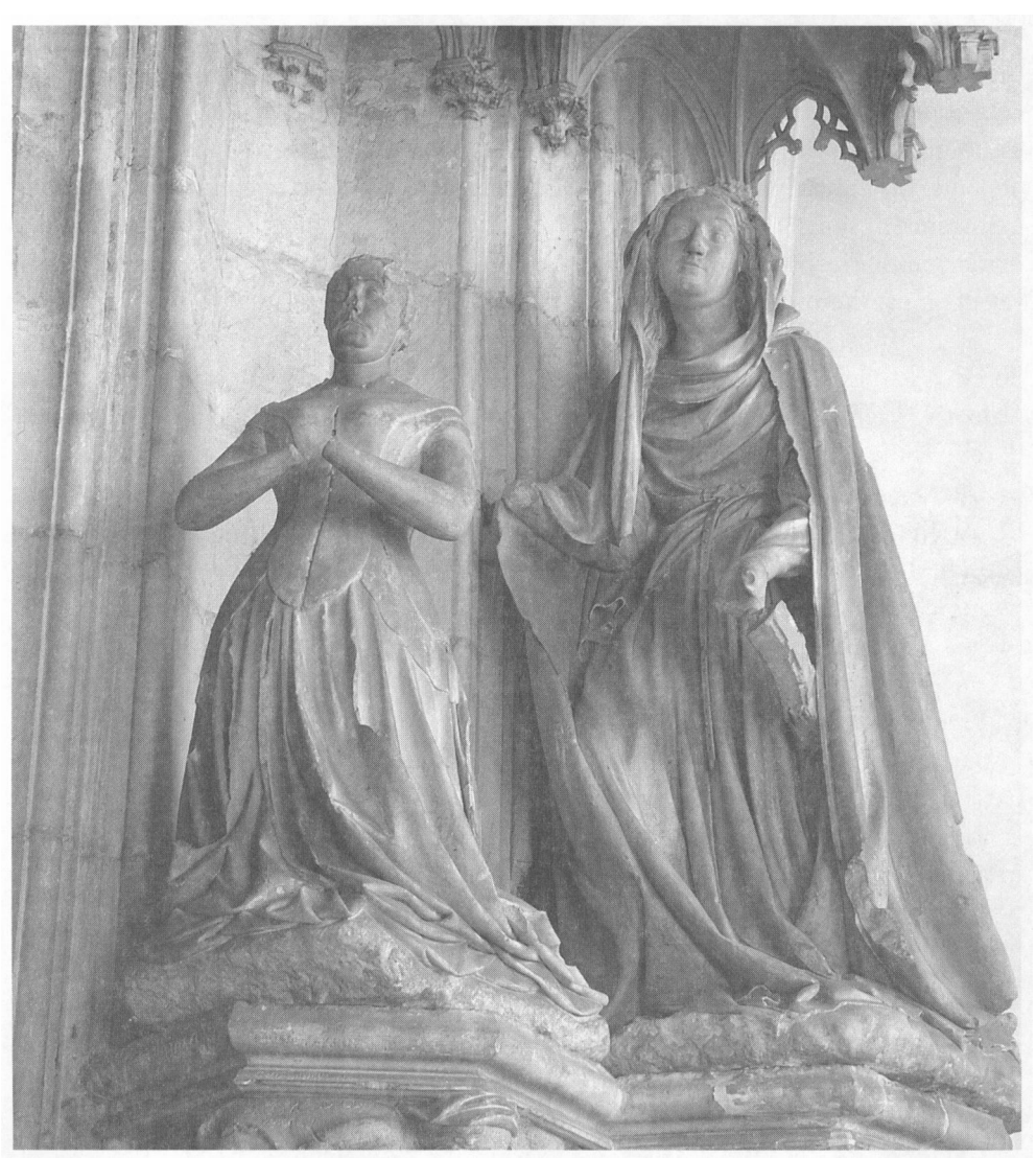
Fig. 1. Claus Sluter, Margaret of Flanders with St. Catherine of Alexandria. Stone, detail of the portal of the Chartreuse de Champmol. 1385–1401.

as shown as a different and inferior type of man whose deficiencies justify Norman domination. Caviness thus contributes to a much larger literature that reveals the inadequacy of a binary definition of sex in biological, cultural, and historical terms. Such scholarship interrogates and even redefines the current OED 's definition of "sex" as "either of the two main categories (male and female) into which humans and many other living things are divided on the basis of their reproductive functions" (1.a). Our gendered readings can both deconstruct and reshape our vocabulary, our concepts, our relationship to our history, and our lived realities.