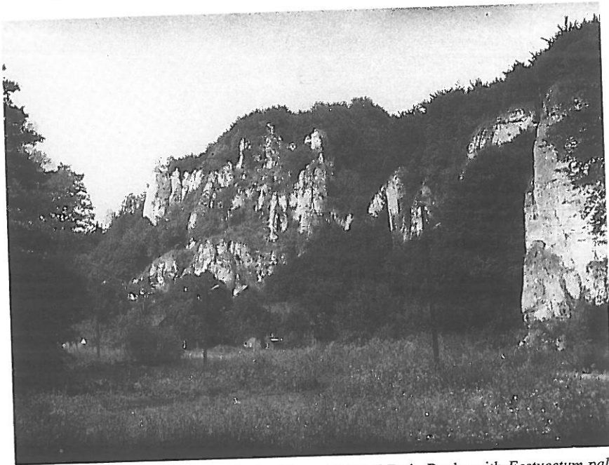
Fig. 4. The Pradnik river valley in the Ojcow National Park. Rocks with Festucetum pallentis and the xerothermic brushwood Peucedano cervariae-Coryletum ; unknown meadows with Cirsium oleraceum in the foreground. Photo by A. Medwecka-Kornas, 1988.

1 - Pino-Quercetum , Pinus sylvestris variant, 2 - Pino-Quercetum , Abies alba variant, 3 - Pino-Quercetum , Fagus sylvatica variant, 4 - Dentario-Fagetum , Galium odoratum - Maianthemum bifolium variant, 5 - Dentario-Fagetum , Dentaria glandulosa variant, 6 - Phyllitido-Aceretum , 7 - Ctenidietalia , 8 - Tilio-Carpinetum , 9 - Festucetum pallentis , 10 - Peucedano cervariae-Coryletum , 11 - Alno-Padion (fragments). a - acid podzolic soil, b - neutral soil (brown forest soil, rendzina soil, etc.).