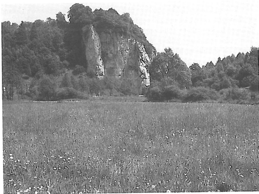
Fig. 1. Limestone rocks in the northern part of the Ojcow National Park. In the foreground a mown meadow of the Arrhenatheretum elatioris association.

More than 950 species of vascular plants of very different ecological requirements occur in the Ojcow N.P. (MICHALIK 1978). There are more than 50 mountain species among them (e.g. Aconitum moldavicum , Centaurea mollis , Dentaria glandulosa [= Cardamine glanduligera ], Polystichum aculeatum , Valeriana tripteris , etc.). There are also very many xerothermic elements of southern and southeastern origin (e.g. Aster amellus , Campanula sibirica , Cirsium pannonicum , Elymus hispidus [= Agropyron intermedium ], Festuca rupicola [= Festuca sulcata ], Melica transsilvanica , Prunus fruticosa [= Cerasus fruticosa ], Stipa joannis , Thymus glabrescens , Veronica austriaca , etc.). Locus classicus of Betula oycoviensis , a controversial taxon formerly believed to be a local endemic, is situated in the lower part of the Pradnik Valley (STASZKIEWICZ and WOJCICKI 1992, this volume).