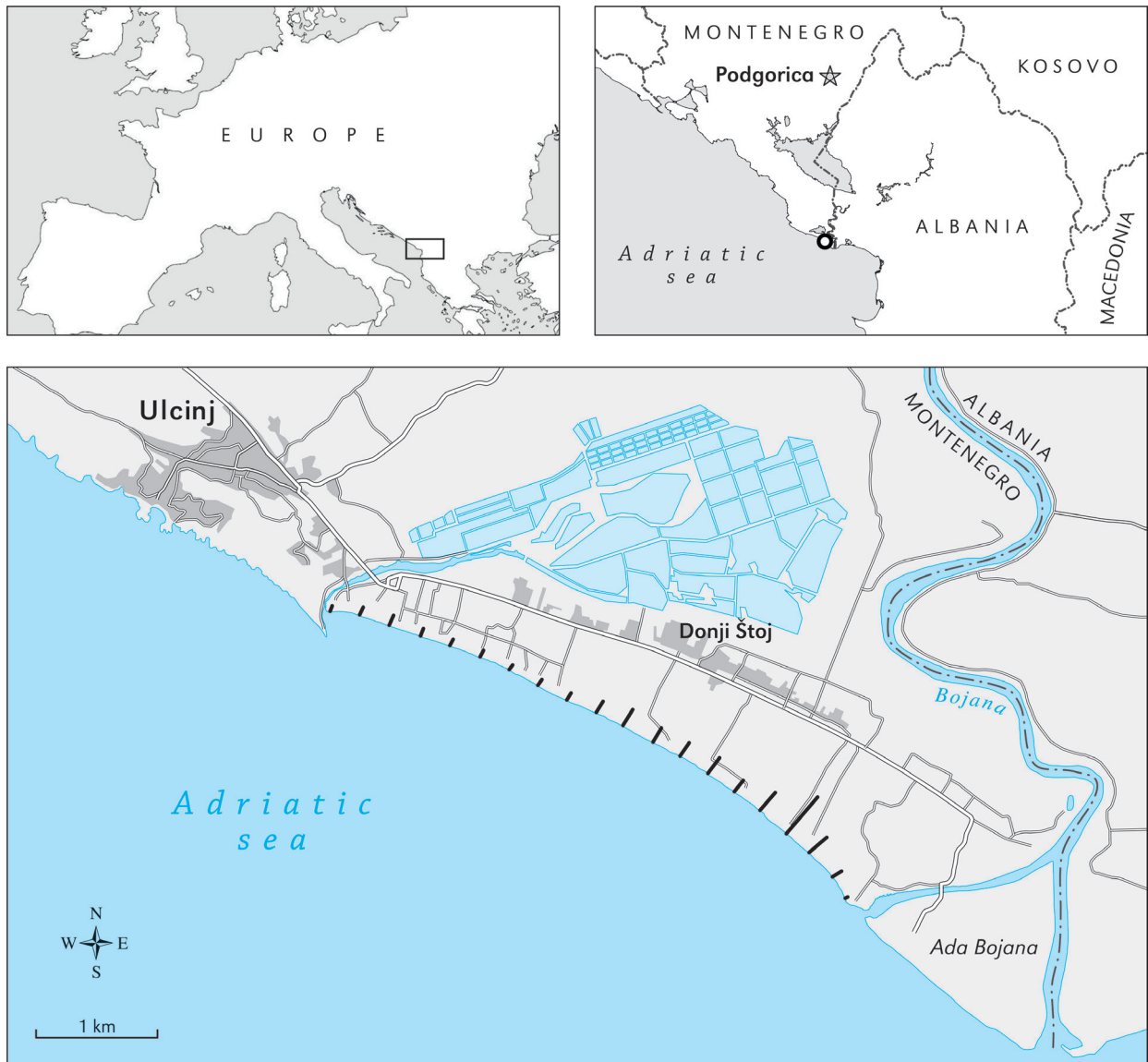
Figure 1. Location of the studied Velika plaža (Montenegro).

tem, with forest vegetation. We also analysed plant communities of interdunal depressions and humid slacks, which are often overlooked in similar studies. For the longest transects, which had large homogeneous areas of singular plant communities, the quadrats were placed 20 m apart from each other along the transect (and not contiguously). In each quadrat, the cover of plant species was visually estimated on the Braun-Blanquet scale (41). Since transects were performed in the late spring and early summer of 2015, when Erigeron canadensis L., E. sumatrensis Retz. and Oenothera species are just starting to germinate, it was not possible to identify this species. Identification was therefore left at the genus level. For the area, the following Oenothera taxa were reported: O. × fallax Renner, O. glazioviana Micheli, O. biennis L., and O. suaveolens Pers. ((42-44) and own field observations).