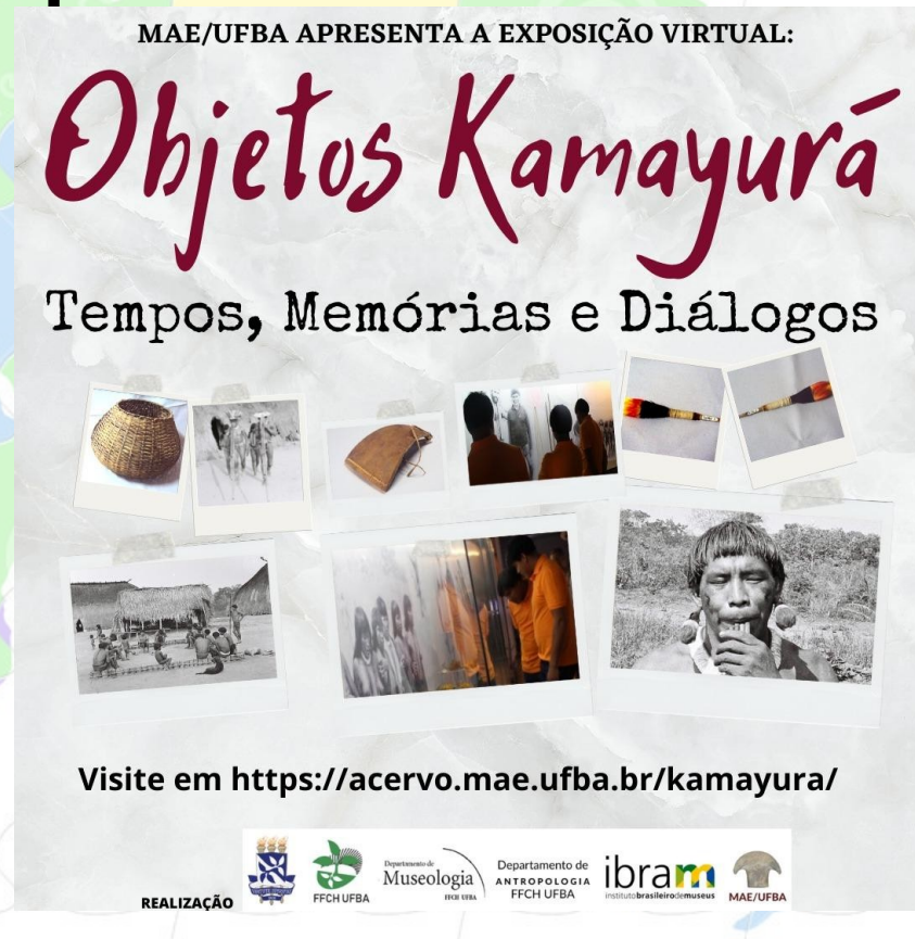
Image: Kamayura exhibition at MAE

Multiplying knowledge Indigenous women scholars Favelas' scholars