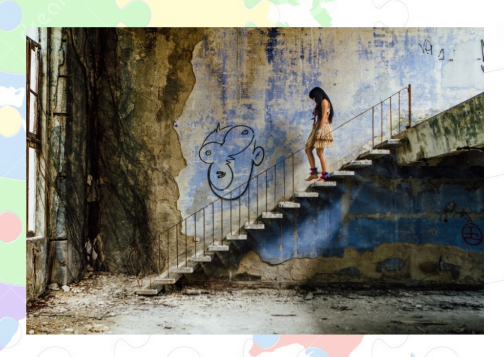
Image: Aldeia Maracanã, by Elisa Mendes (source: <a href="https://amazonialatitude.com/">https://amazonialatitude.com/</a>)