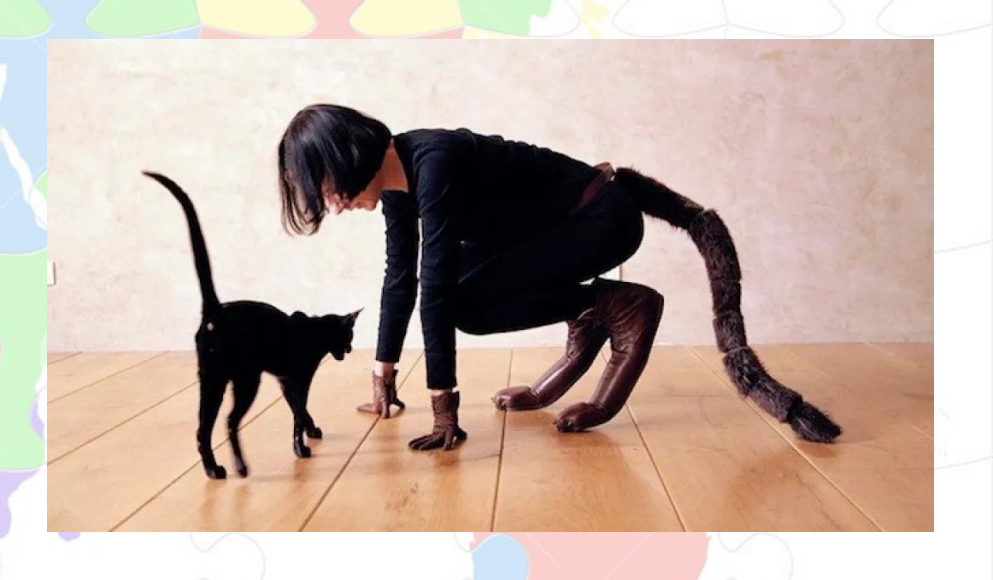
Image: Art orienté objet, byLaval-Jeantet & Mangin, Félinanthropie, 2007