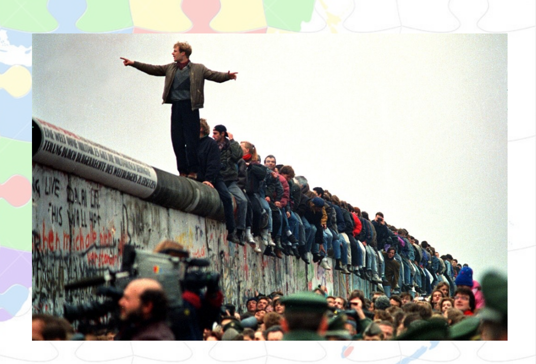
Image: The Berlin wall

*Latour, Bruno. 1993. We have never been modern. Cambridge: Harvard University Press.