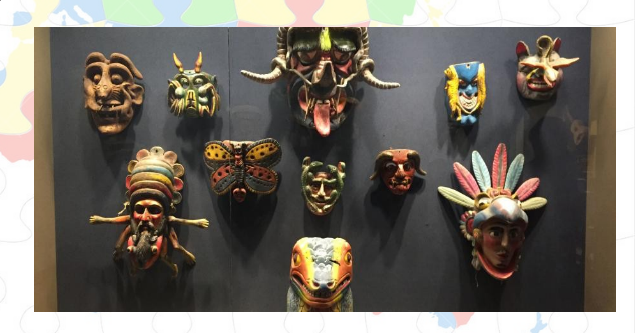
Image: Anthropology Museum and Museum Anthropology, by Anita Erle, 2016 (source: <a href="https://www.anthroencyclopedia.com/">https://www.anthroencyclopedia.com/</a>)