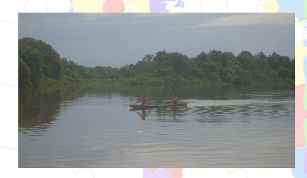
Image: the Mebengokré on the Bacaja river

Toward a science of intrinsic purposiveness