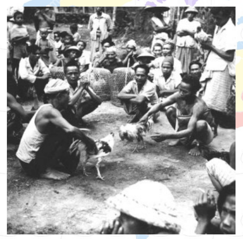
Image: Balinese Cockfight 1949 by Alred Palmer (source: <a href="https://anthromamadotcom.wordpress.com">https://anthromamadotcom.wordpress.com</a>)

"who speaks? who writes? when and where? with or to whom? under what institutional and historical constrains?"*