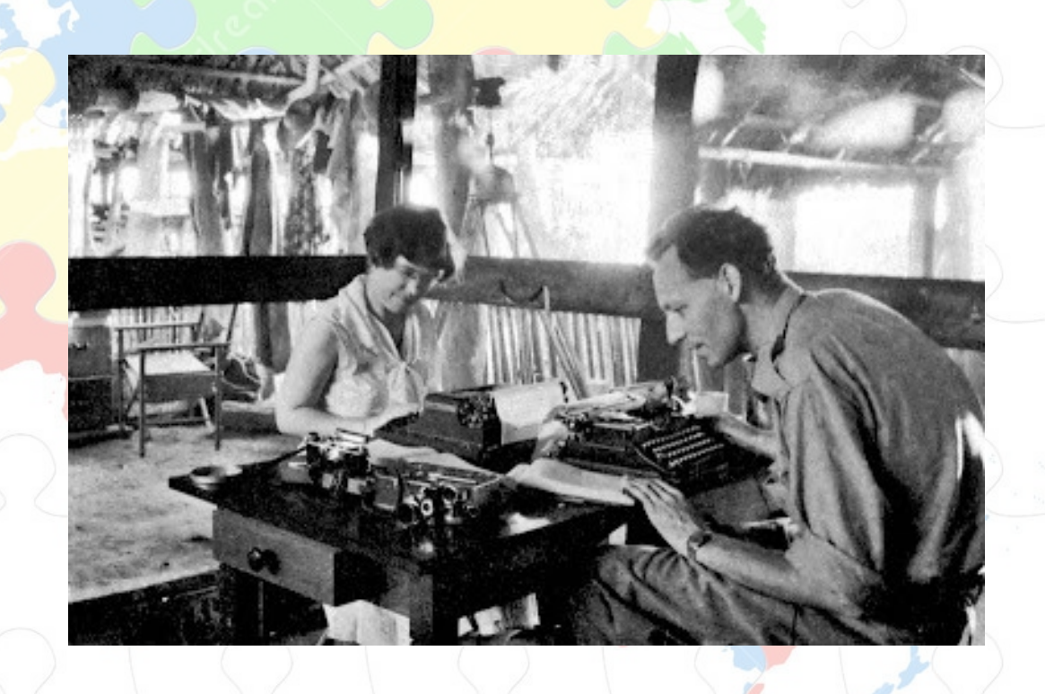
Image: Mead and Bateson at Bali