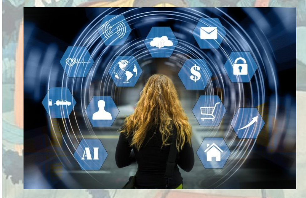
Image: "Technology 2020" by Mikhail Denishchenko (source: https://www.publicdomainpictures.net/en/viewimage.php?image=320340&picture=technology-2020)

Not growth or evolution (not immanent, natural or cumulative)