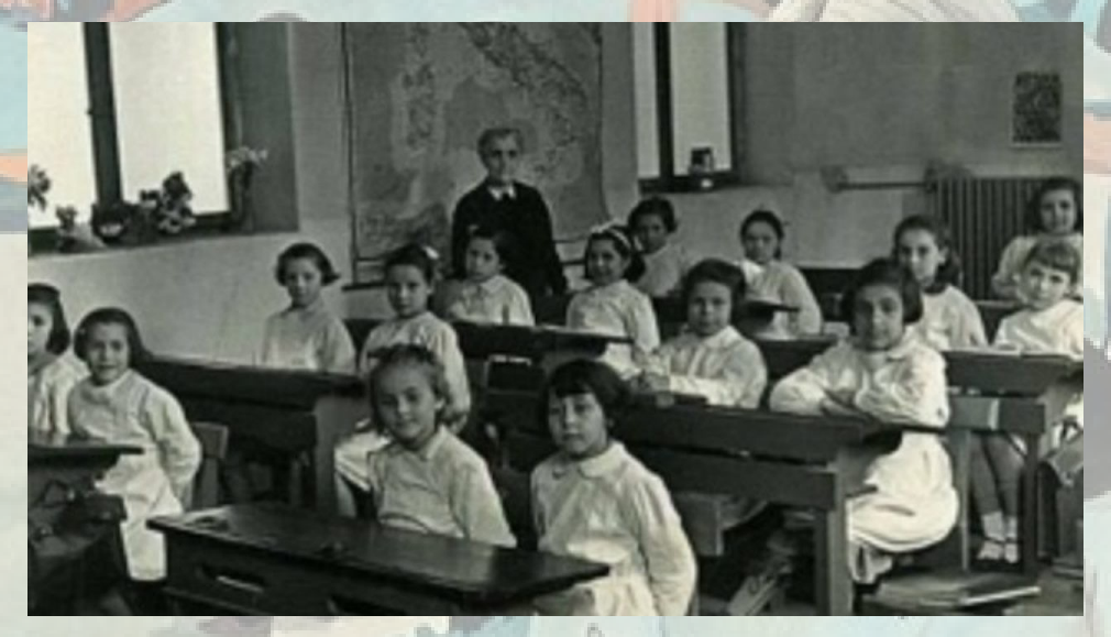
Image: venetian school at the beginning of '900

Enculturation: the process of socialization of the individuals in a group