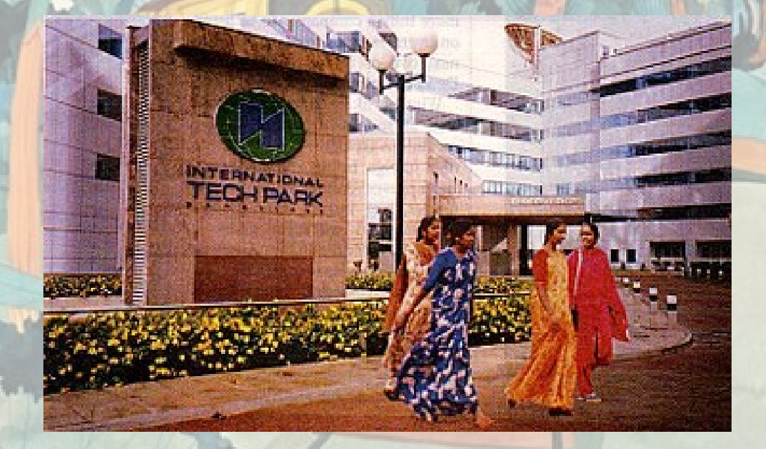
Image: India

Modernization Individualization Democratization Globalization ...a(c)tion