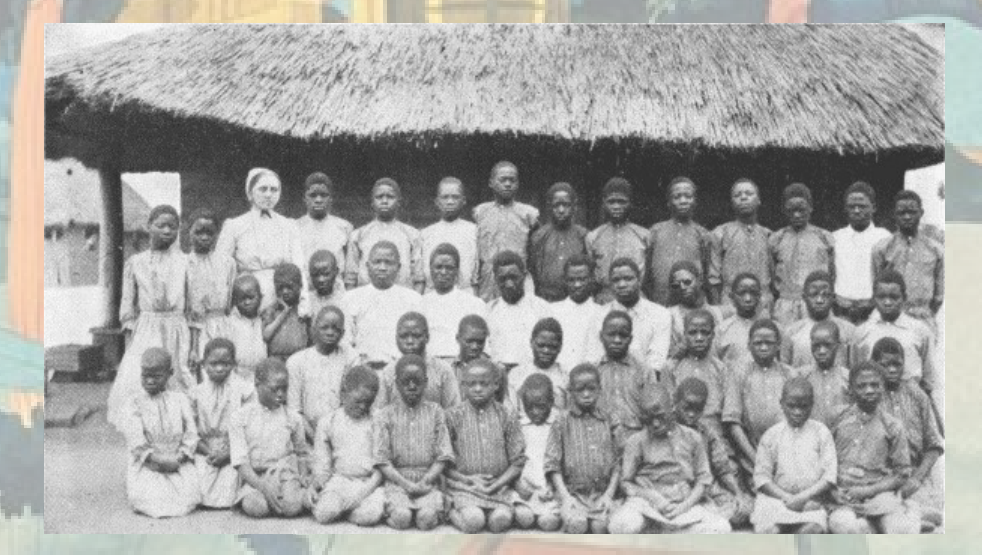
Image: Macha Mission School, Zambia, 1910

From contacts between "cultures" and exchange of traits, knowledges, etc.