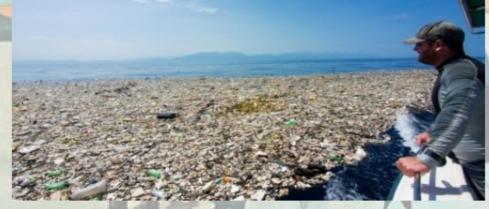
Image: Plastic trash island