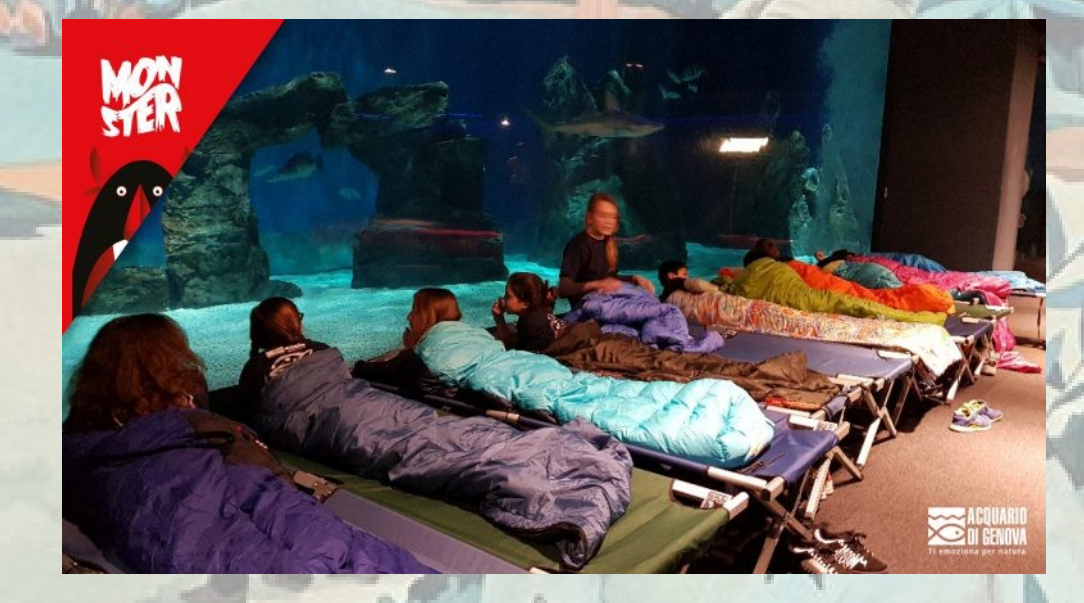
Image: Genova aquarium

*Barth, Fredrik. 1967. On the Study of Social Change. American Anthropologist 69(6): 661-669.