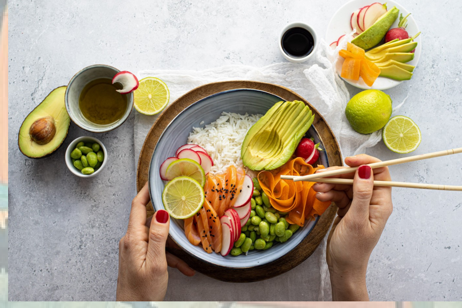
Image: traditional and new plantations in Sicily

Description of a change via multiple prolonged fieldworks