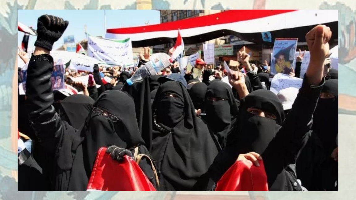
Image: Popular protests in Yemen in 2011

"categories and assumptions of improvement are still with us everywhere. We imagine their objects on a daily basis: democracy, growth, science, hope"*