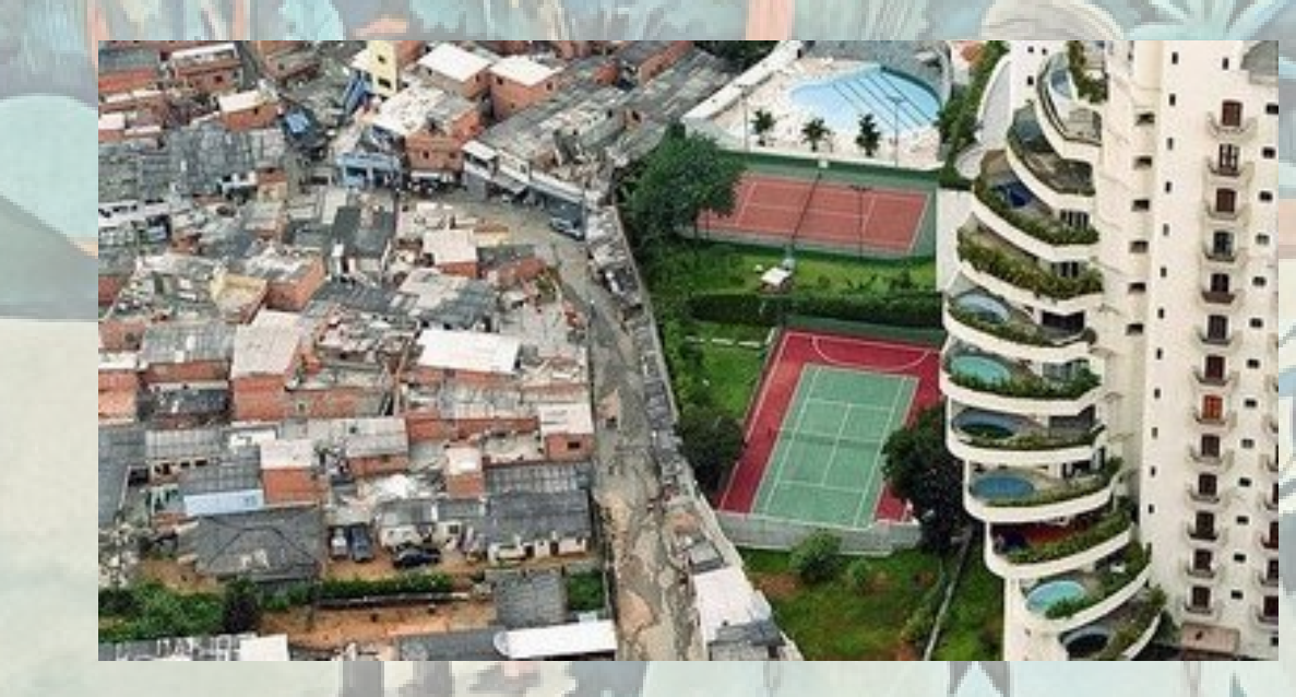
Image: Disparity in Brazil