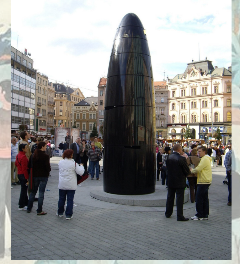
Image: Brněnský orloj