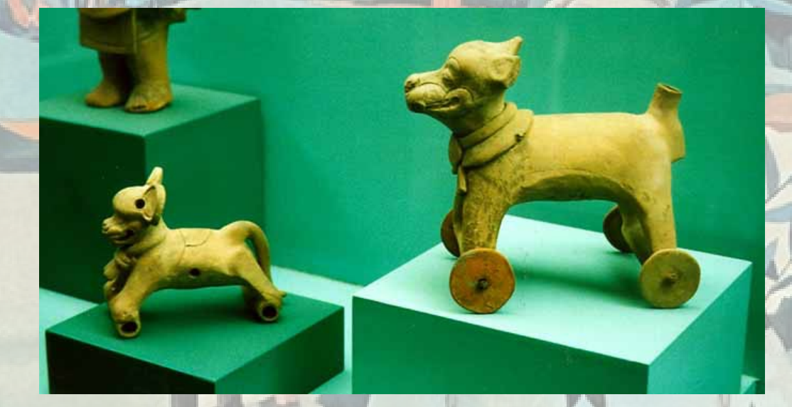
Image: Mesoamerican toys with wheels (source: https://www.mesoweb.com/mpa/nationalmuseum/veracruz1.html)

- <u>diffusion</u> (acquisition from other people)