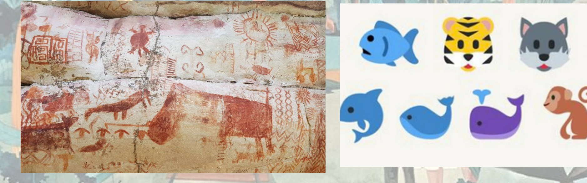
Image: Animal emojis

Image: Rock art in Colombian Amazon