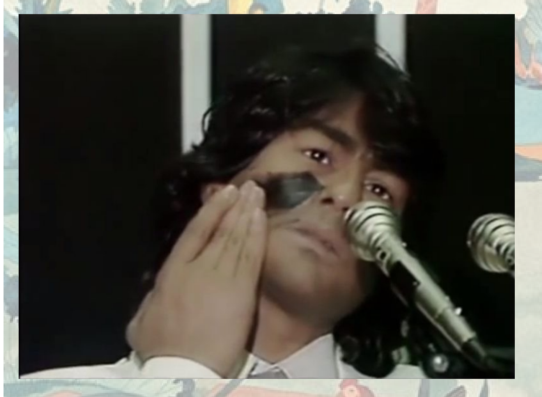
Image: Ailton Krenak painting his face during the Brazilian Constituent Assemblyin 1987