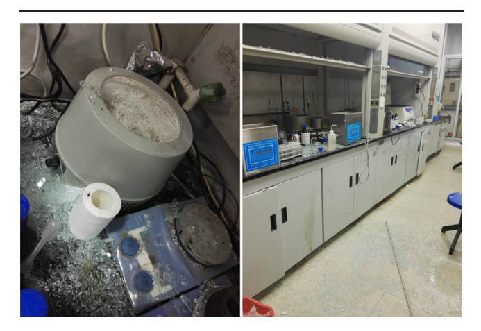
Figure 2. Fume hood damaged by explosion of perchloric acidorganic compounds digestion reaction. (Reproduced with permission from Professor Qin Kuang.)

observed the digestion process by the side. After about 1.5 h, the graduate student left the scene. About 5 min after leaving, the digesting solution exploded. The explosion shattered the tempered glass on the front of the fume hood (Figure 2). No personal injury was caused.