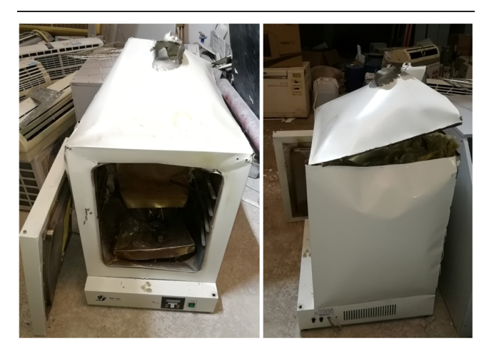
Figure 1. Front and side views of the oven after explosion of the hydrothermal reactor.

2.2.4. Accident 12: Explosion Occurred When Heating Nitric Acid—Hydrogen Peroxide to Clean the Hydrothermal Reactor. On August 20, 2019, an explosion occurred in the oven when a master student was using it to clean a hydrothermal reactor in the corridor in a chemical engineering building in eastern China. 20 mL of dilute nitric acid, a few drops of hydrogen peroxide, and 30 mL of water were added to a 100 mL pressure reactor, and the oven temperature was set at 180 °C. The strong pressure generated by the explosion pierced through the top plate of the oven, the oven door was knocked off, and the hydrothermal reactors flew out (Figure 1). Fortunately, no one passed by at the time, and no one was injured.