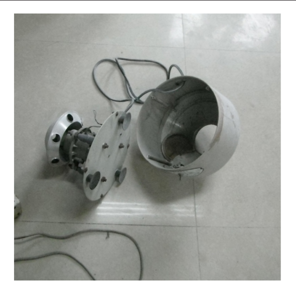
Figure 3. Exploded centrifuge fell to the ground. The ground had been swept.

the autoclave was not completely relieved, resulting in an explosion, and caused the student to die on the spot. No further specific information is available.