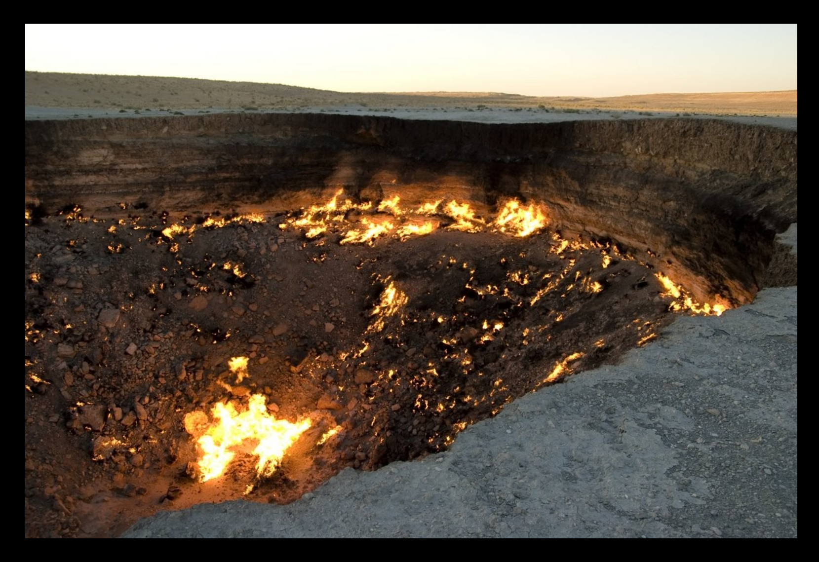
The geologists decided to torch the well to eliminate such toxic gas,