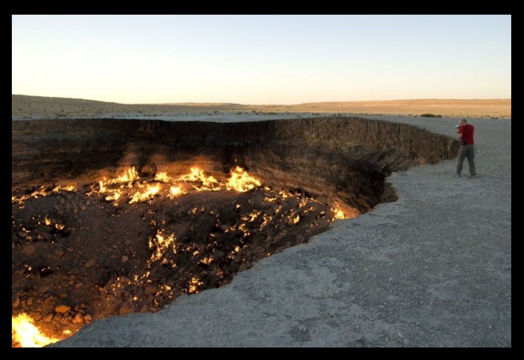
The intense heat coming from the crater allows to approach the place only for a few minutes because of the unbearable temperature.