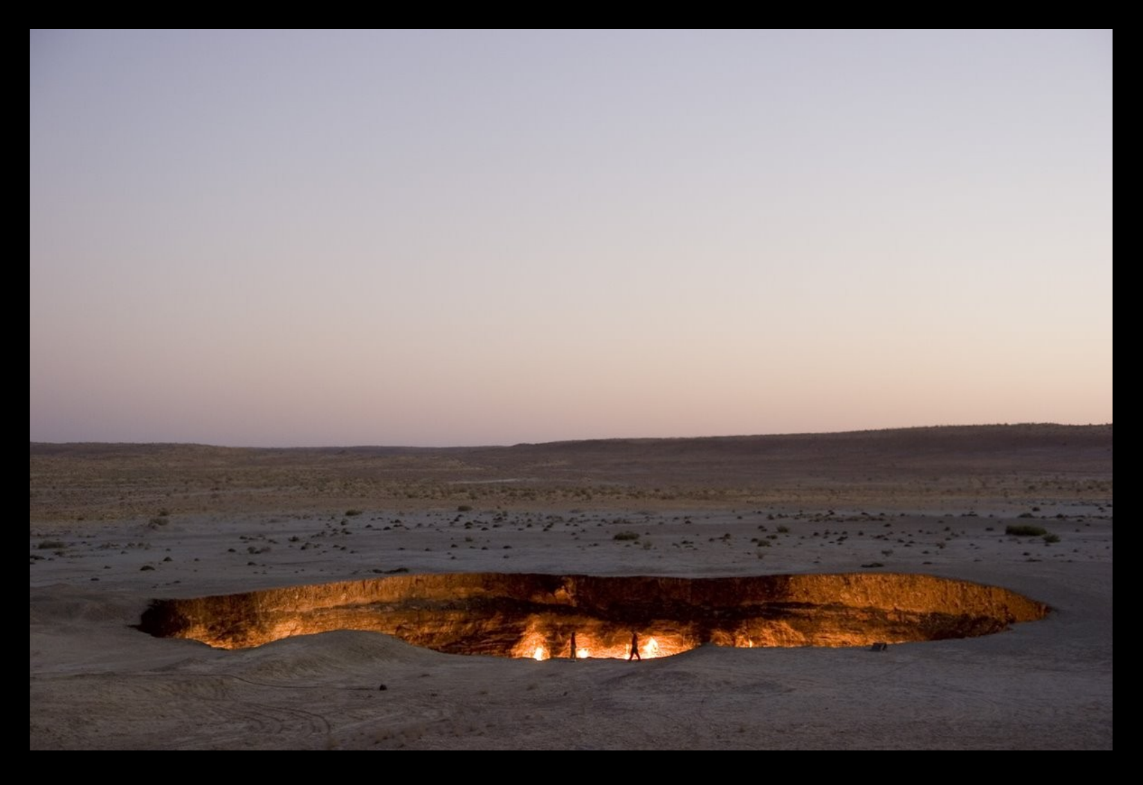
In 1971, a drilling provoked the collapse of an underground cavity, so revealing a gaping hole leaking enormous quantities of gas.