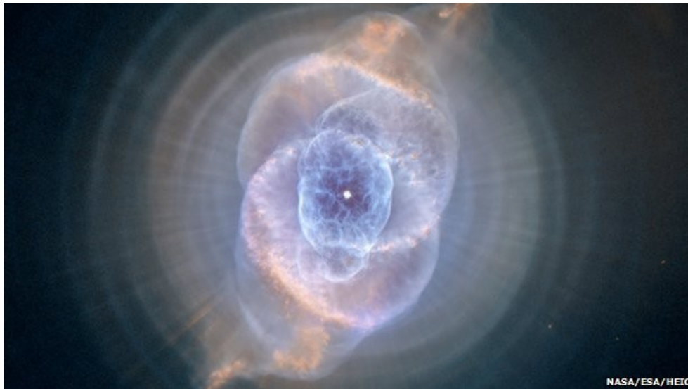
one of the "five best images" chosen by Physics World