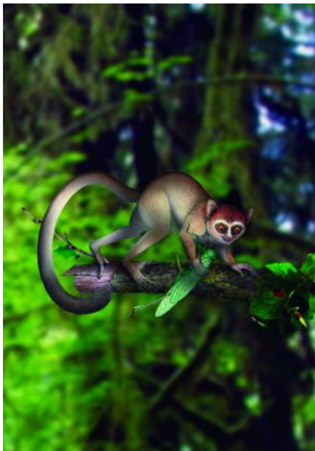
This is an artist impression of Archicebus achilles in its natural habitat of trees.

The fossil has been named, Archicebus achilles .