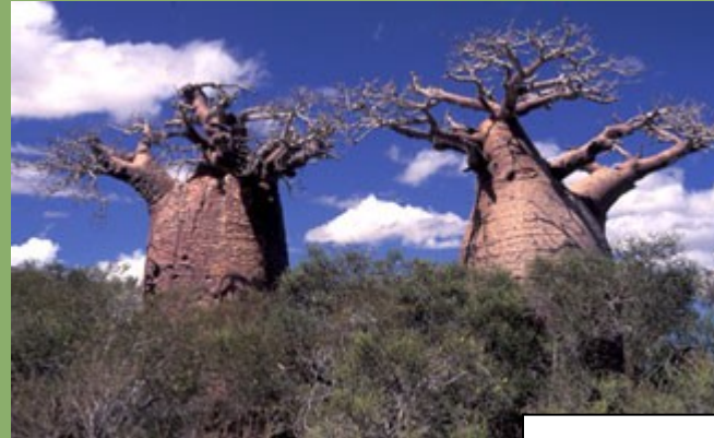
Adansonia rubrostipa www.cb garden.org