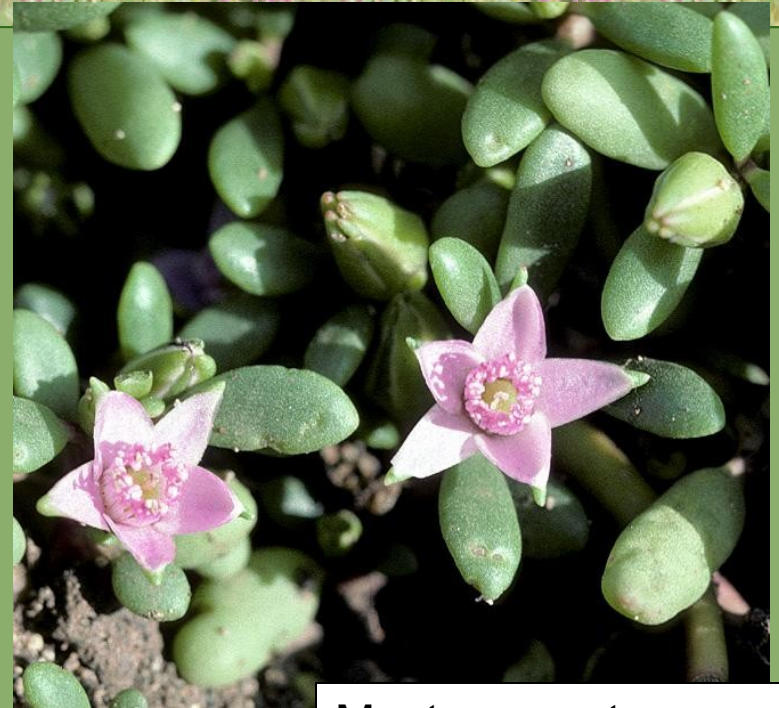
Maytenus octogona www.tortoisetours.com