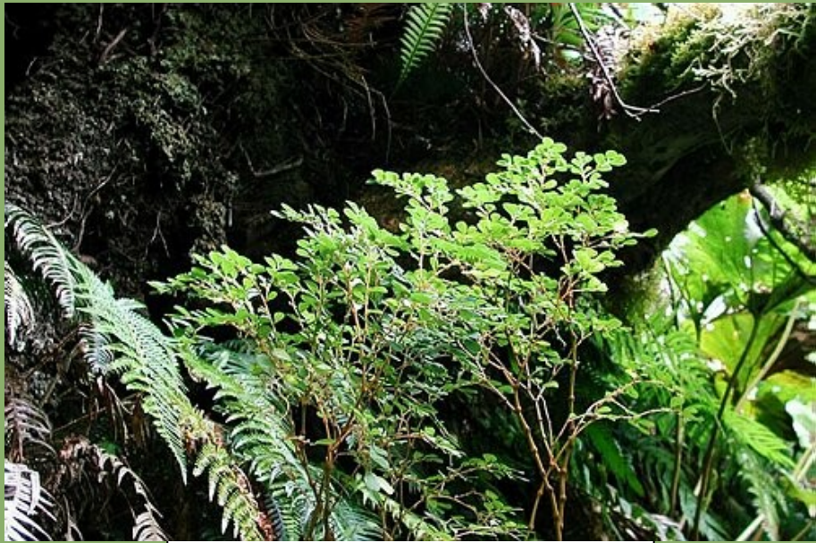
Lactoris fernandeziana