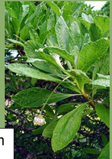
Commidendrum robustum www.globaltrees.org