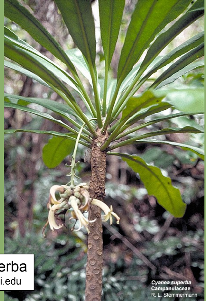
Cyanea superba www.botany.hawaii.edu