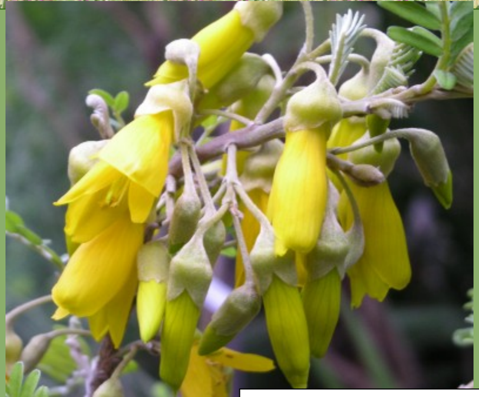
Sophora toromiro www.botanic-garden.ku.dk