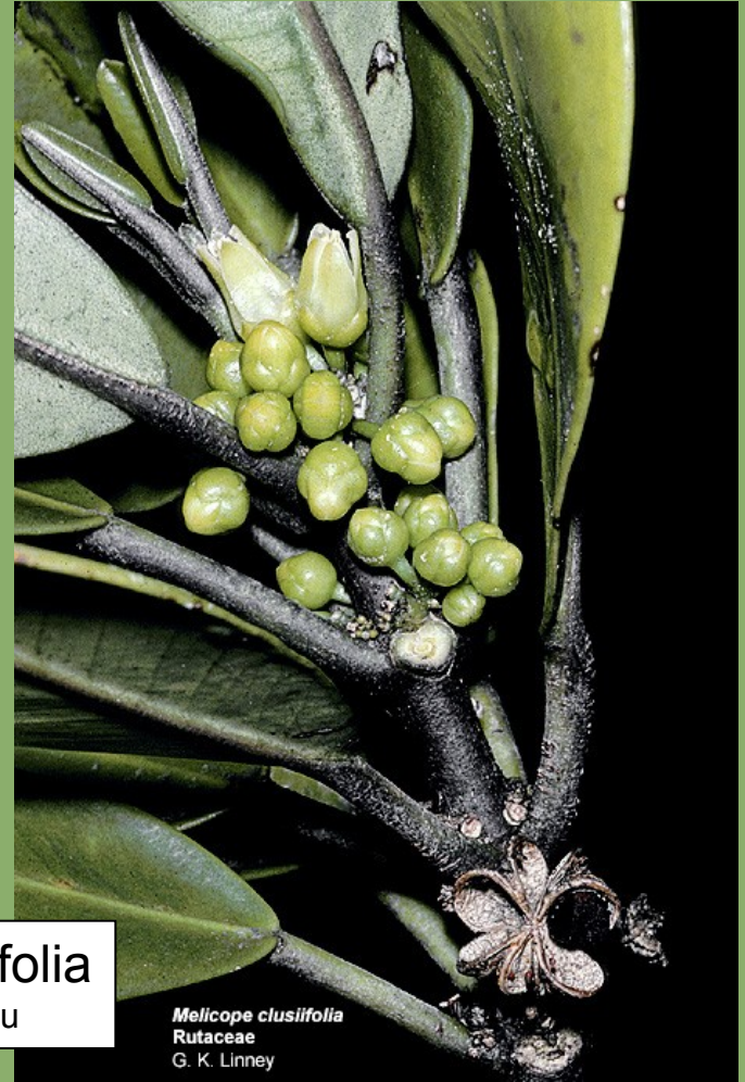
Melicope clusiifolia Rutaceae