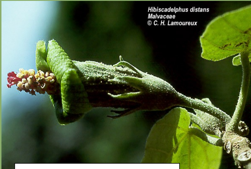
Hibiscadelphus distans Malvaceae