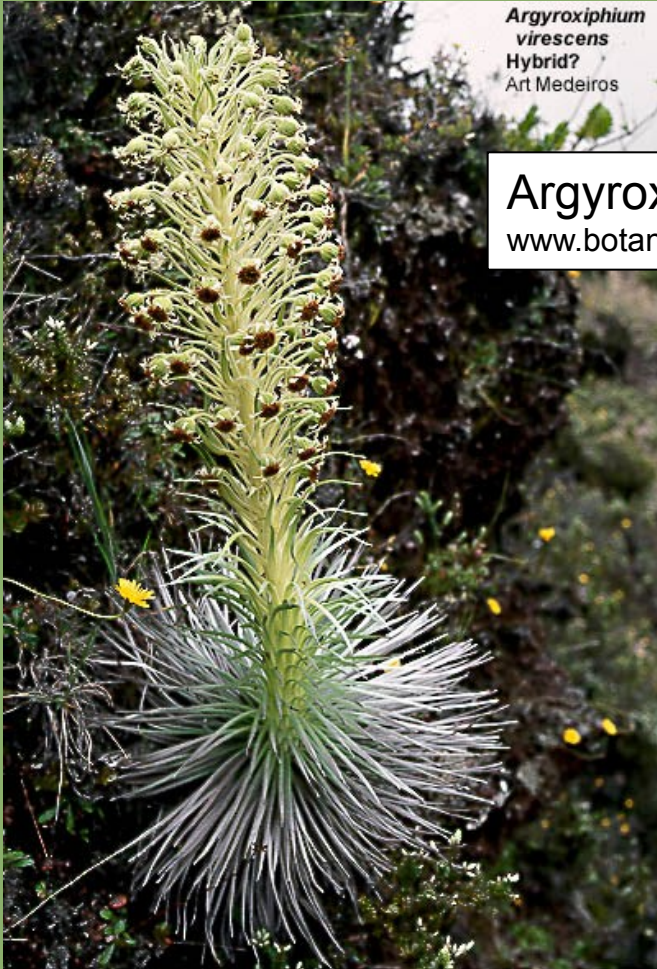
Argyroxiphium virescens www.botany.hawaii.edu