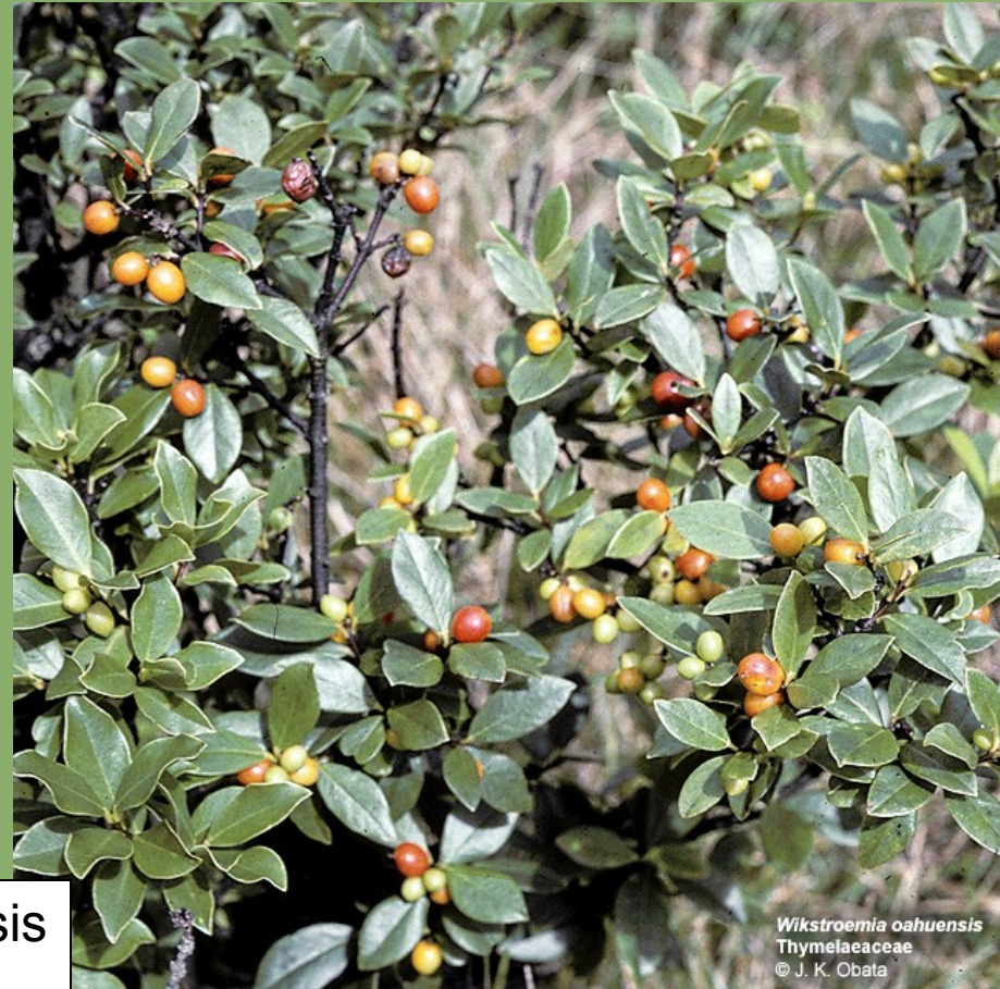
Wikstroemia oahuensis Thymelaeaceae