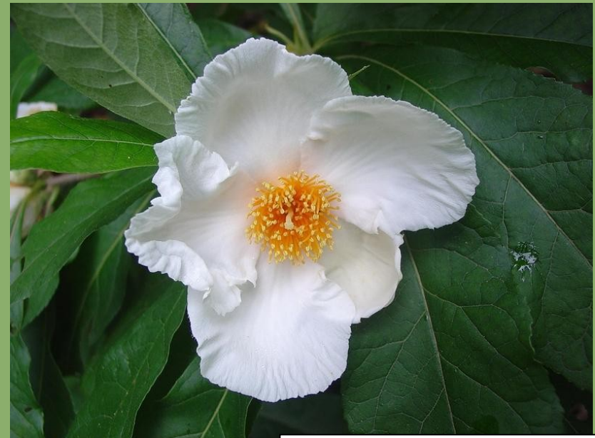
Franklinia alatahama