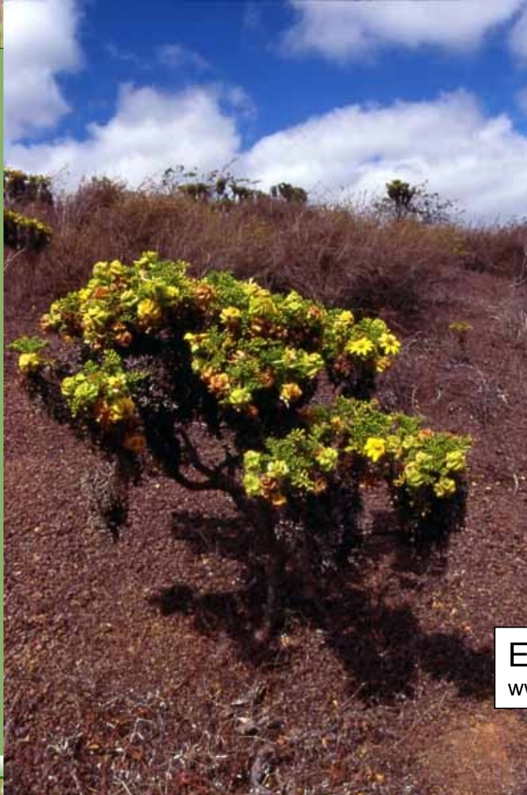
Erigeron compositus