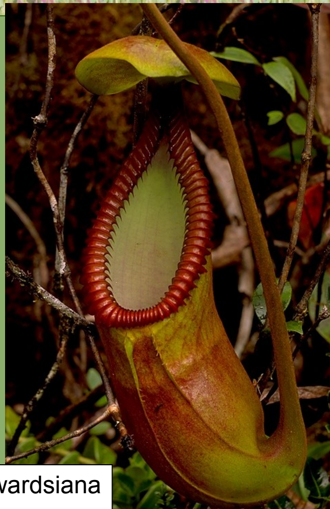
Nepenthes edwardsiana www.omnisterra.com