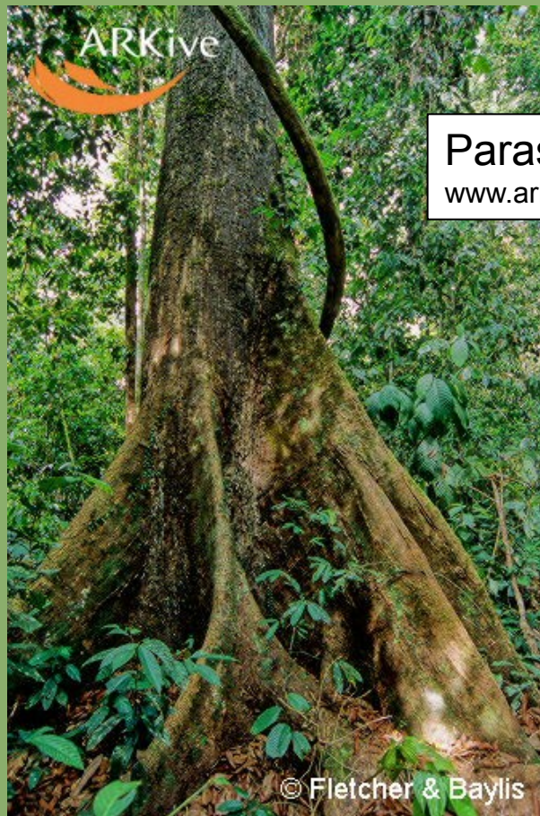
Parashorea macrophylla www.arkive.net