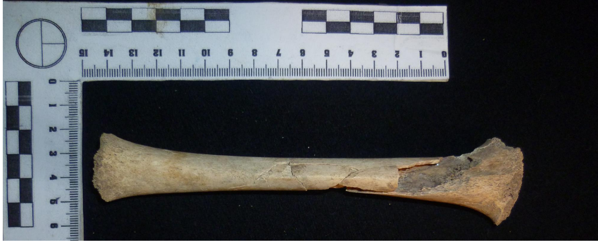
Perinatal human tibia