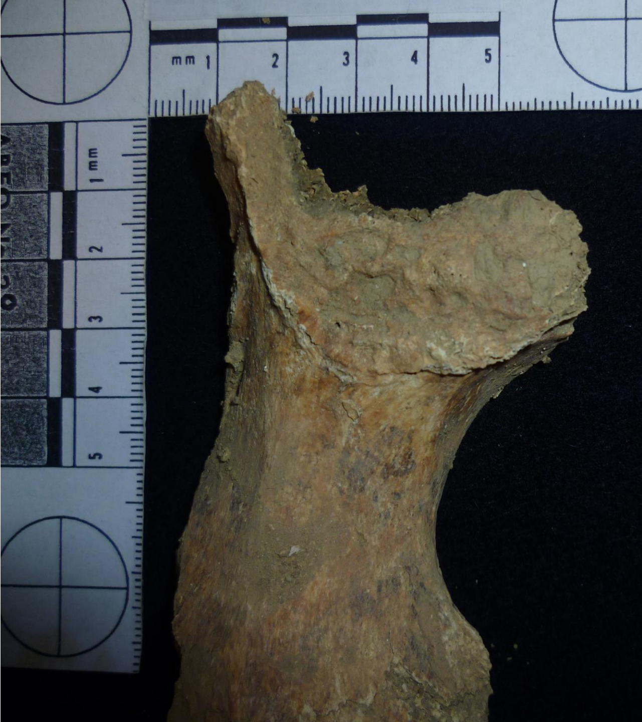
Fragmented human os coxae