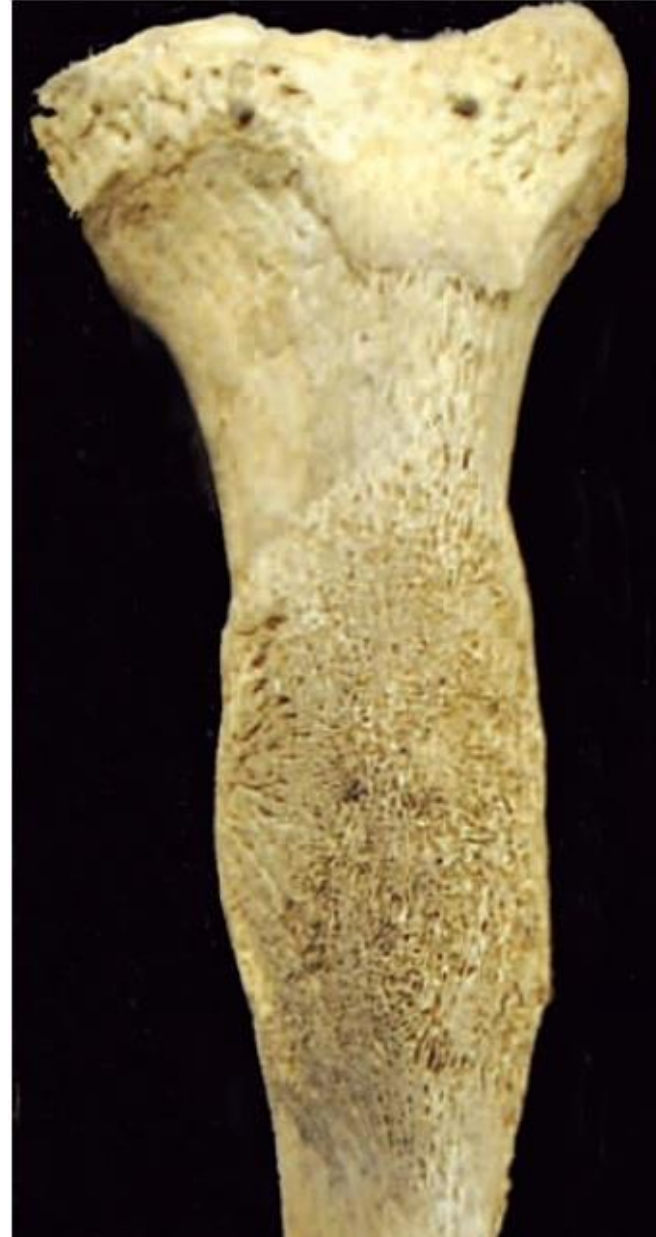
Human Tibia (syphilis)