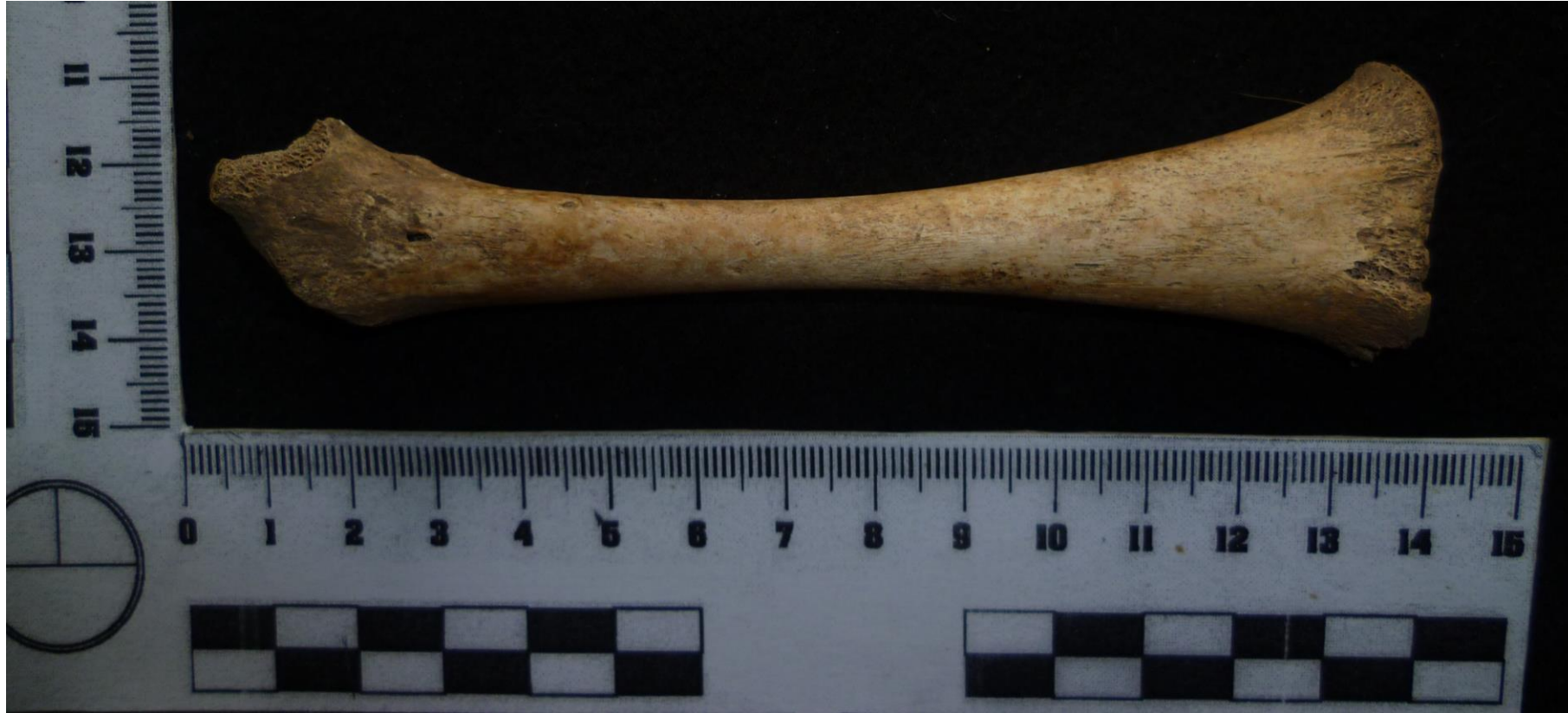
Human perinatal femur with taphonomic alteration