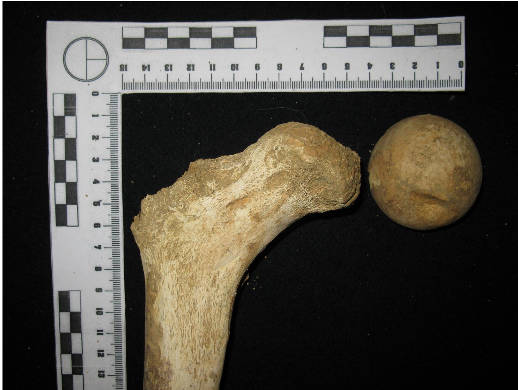
Human subadult femur