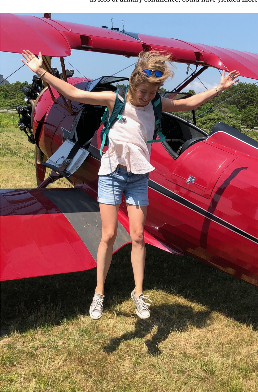
Fig 2 | Representative study participant jumping from aircraft with an empty backpack. This individual did not incur death or major injury upon impact with the ground

The PARACHUTE trial satirically highlights some of the limitations of randomized controlled trials. Nevertheless, we believe that such trials remain the gold standard for the evaluation of most new treatments. The PARACHUTE trial does suggest, however, that their accurate interpretation requires more than a cursory reading of the abstract. Rather, interpretation requires a complete and critical appraisal of the study. In addition, our study highlights that studies evaluating devices that are already entrenched in clinical practice face the particularly difficult task of ensuring that