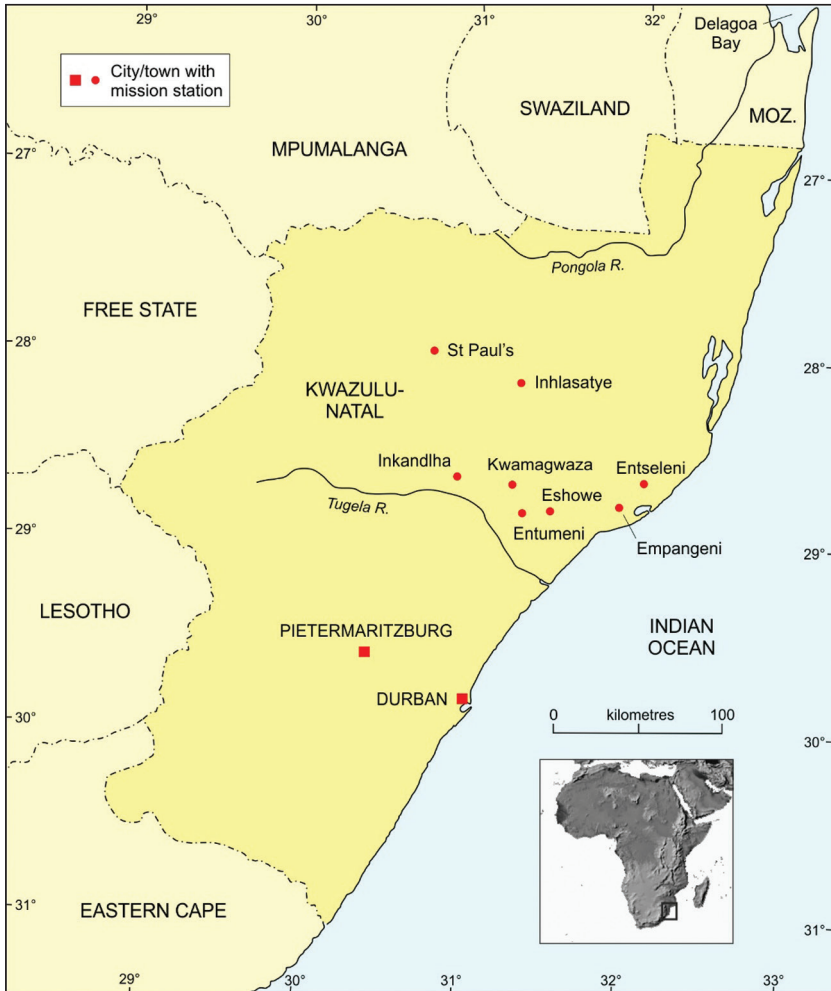
Figure 1. Map showing key locations referred to in the text against present-day boundaries of KwaZulu-Natal province, South Africa.