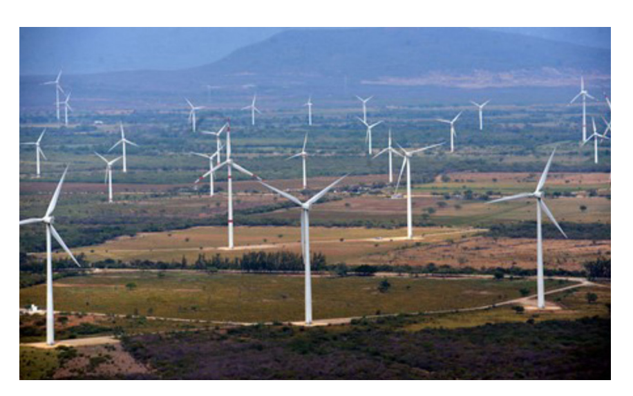
Figure 5.3 Wind Park in the North Istmo.

Since 2004, wind energy development has resulted in the construction of 1,642 wind turbines (Rivas 2015; Rubí 2016) with twice this number being planned for