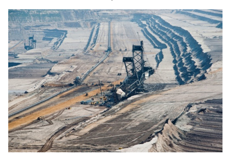
Figure 5.1 Hambach Mine.

people, the destruction of one of Europe's most ancient and biodiverse forests (the Hambacher Forest) and the release of more greenhouse gas emissions than any other industrial project in Europe (Brock & Dunlap 2018). Despite intense resistance against the mine - forest occupations, demonstrations and sabotage, among others (Anonymous 2016) - the social and ecological disaster in and around the mine continues to unfold.<sup>6</sup> The defence of the mine at any cost by police and corporate security forces is embedded in Germany's long tradition of surveillance of resistance, intensifying social control and increasingly visible authoritarian state structures leading to violent responses to any kind of contestation. Most recently, this can be seen in the violent repression of environmental defenders attempting to stop the construction of a new highway in 2020 (Brock 2020a) as well as the well-documented state violence against G20 protesters and their long prison sentences in 2017 (NDR 2017).8 Both point to the hypocrisy of the image of the German state as both socially and environmentally progressive. The former state-owned electricity provider, coal mine operator, nuclear and renewable energy producer, and self-proclaimed 'energy giant' RWE and its shareholders continue to benefit from political support for ecologically destructive activities like coal-mining and their close ties to the political establishment (Brock & Dunlap 2020).9