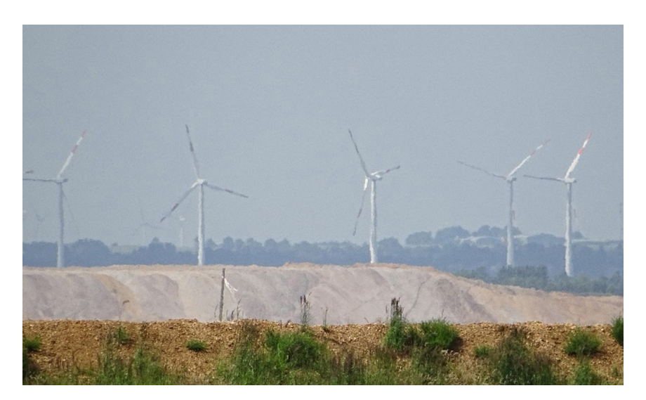
Figure 5.2 Windmills at the Edge of Hambach Mine.

Meanwhile RWE's sponsorships and multiple strategies to buy and engineer consent create new dependencies while the displacement of entire villages increases social fragmentation and alienation from each other and the land, breaking down social relationships. The world's largest hole continues to migrate. This 'hole' is visible from the four-lane highway that cuts through the landscape, allowing drivers to catch a glance of the moon-like landscape. The solar panels lining the highway, and