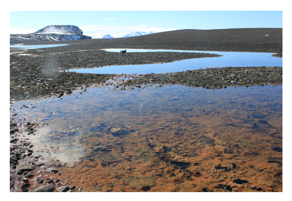
Fig. 3. Cyanobacterial mats formed in Interlago 2 (in front) and Interlago 1 lakes (in the middle).