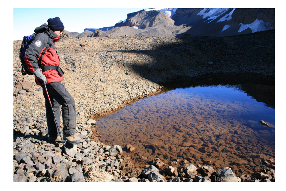
Fig. 2. Dulanek Lake represents an example of smale-area water pool. The bottom is covered by thick cyanobacterial mat.

bottom is fully covered by a cyanobacterial mat (see Fig 3). Dominating matforming specieas are Calothrix sp., Calothrix elsteri, Leptolyngbia antarctica, Hassallia antarctica, Hassallia andreasse nii sp. nova as reported by Komárek et Elster (2008), Komárek et al. (2008).