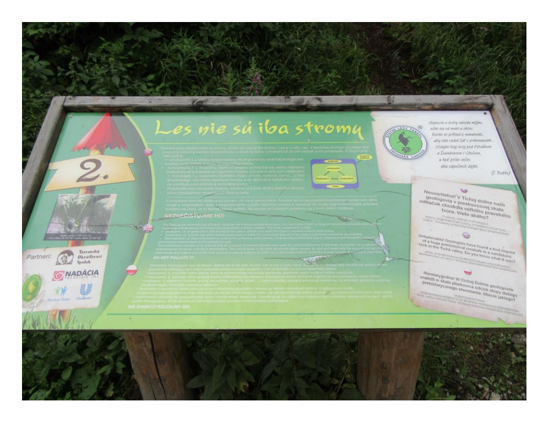
Fig. 3: Graphical design of panel no. 2 "The forest is not just trees"