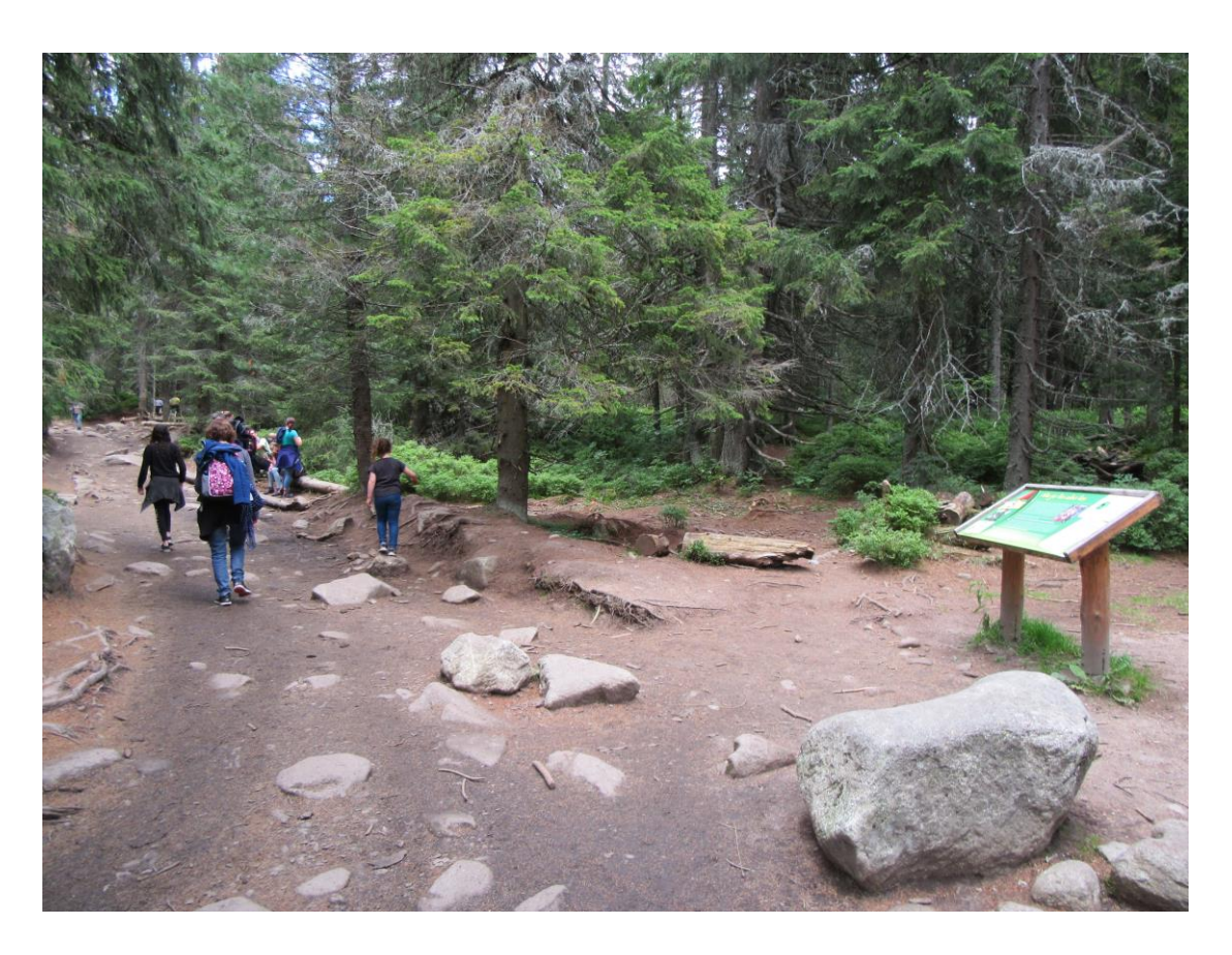
Fig. 2: Location of panel no. 5 "There is no forest like a forest"

"Forest and avalanches" but apart from the information about the avalanche accident, there is no connection with the forest.