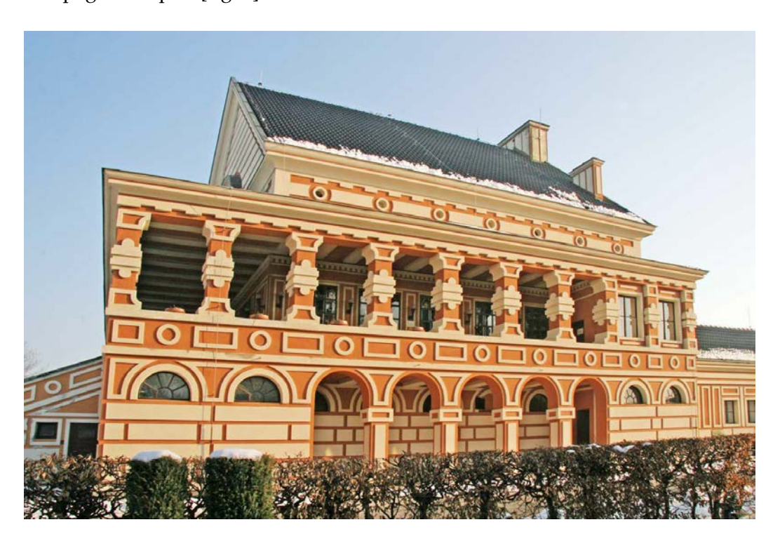
Figure 3 Pavel Janák, Crematorium in Pardubice, Czech Republic.

In this regard, the short interwar embrace of vernacular language especially in contemporary architecture and design, which in effect received Wirth's and Matějček's backing, may seem to contradict that view. What came to be known as the national style was associated with experiments in the early 1920s by architects and designers such as Pavel Janák and Josef Gočár (1880-1945). 48 They both put emphasis on the use of bold primary colours in architecture as well as on the use of folk ornament and construction details. Their buildings from this short period include Gočár's design for the Bank of the Czechoslovak Legions in Prague from 1922, which featured bold, contrasting yellow and brown colours and Janák's crematorium in Pardubice of 1921-23 which emphasised pictorial effects of the colourful architecture. Here, the national colours of red, white and blue, were set next to each other in striking contrasts according to the way Janák imagined Early-Slavic pagan temples [fig. 3].