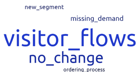
Figure 2 Changes in the behavior of visitors ( n = 120 )

The results show that the majority of respondents (86%, n = 121 ) experienced a significant decrease in the number of visitors compared to the pre-pandemic status. The decrease ranged from 26-50%. This was mainly due to the government restrictions in the form of state border closures (movement restrictions) and lockdown. In addition, two other factors were also evident. Firstly, there was a Change in customer base (Fig. 1) in terms of visitor flows. And secondly, tourism service providers specifically mentioned examples of changes in visitor behavior. These examples were categorized (e.g., Ordering process, New segment, Missing demand). The word cloud (Fig. 2) below shows the frequency of responses (examples) in each category.