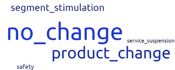
Figure 3 Reactions of tourism service providers (n = 120)

Generally, the response of tourism service providers to the Change/adaptation to customer requirements was sorted out into five categories. The following word cloud below (Fig. 3) presents the frequency of responses in each category. Two exit strategies as a reaction to the changes caused by the COVID-19 pandemic in the first wave (spring 2020) are evident.