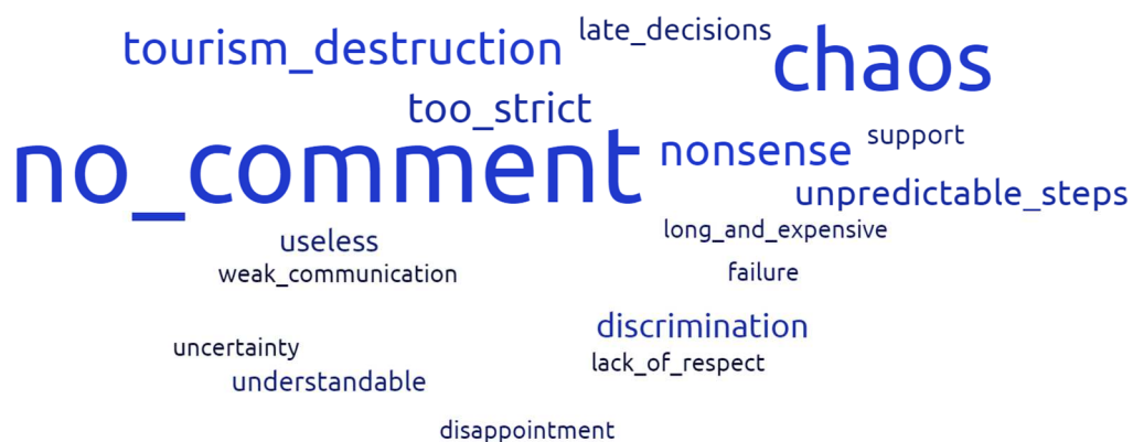
Figure 4 Statements evaluating the government restrictions – word cloud (n = 121)

Generally, tourism service providers managed to cope with the government restrictions even if the respondents' comments on the implemented government measures showed a strongly negative sentiment (74%; n = 121). The categorized evaluative statements are described by the word cloud (Fig. 4). The most frequent statement (more than 1/3) was "no comment", meaning I prefer not to comment. The next most frequent statement was "chaos". Tourism service providers consider the governments restrictions "nonsense" and "tourism destructive".