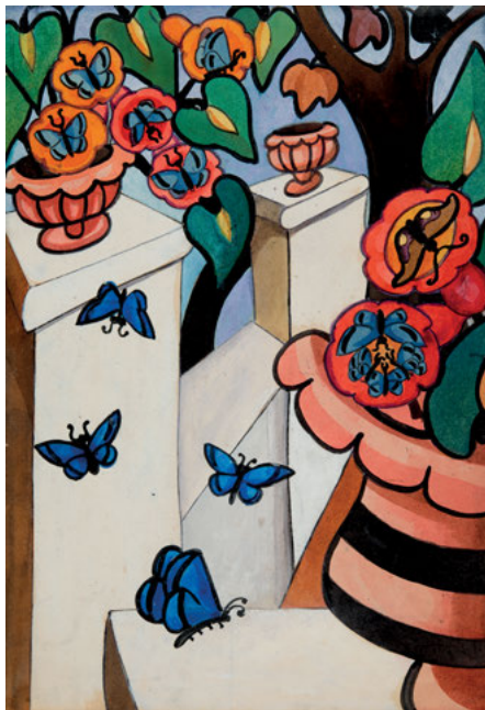
Fig. 2: Anna Lesznai, illustration for The Journey of the Little Butterfly in Fairyland , 1913, ink on paper. © Museum of Fine Arts, Budapest, 2022.

Hungarian, a Jew, an aristocrat disconnected from the rural (Slovak) population of her beloved estate, a city dweller, and, finally, a woman constantly defying conventions in a society of strict etiquette and hierarchy. As a result, the quest for a place of belonging became a dominant theme in her creative work. In this context, Lesznai also developed an understanding of folk art and fairy tales as conceptual models for an ideal world in which humans would harmoniously live alongside each other in a natural environment. Thus, in Nyugat (1918) she would write: