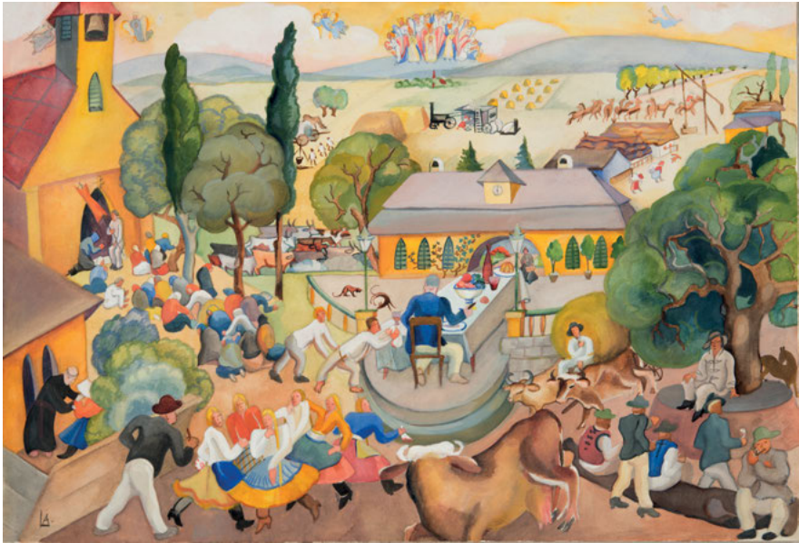
Fig. 3: Anna Lesznai, Sunday , 1930, watercolour on paper. © Museum of Fine Arts, Budapest, 2022.

rope. For a start, the Hungarian émigré artist's continued references to the folk culture of a region (the Slovak countryside around Nižný Hrušov) that now lay outside both her nation of origin (Hungary) and the city of her exile (Vienna) confounded easy national classification. In the new Central Europe of nation-states, understandings of which art “belonged” to which nation had to be negotiated anew. In Lesznai's case, matters were further complicated by the fact that her ornamental treatment of the Slovak countryside was out of step with efforts to use the countryside as a resource in the construction of new national identities. 60 And in a further complication for Lesznai's place in the post-1918 art-historical canon, the folk motifs that she relied upon were incongruous with the thematic predilections of internationally oriented, post-1918 avant-gardes whose art generally betrayed an obsession with technology and modern life.