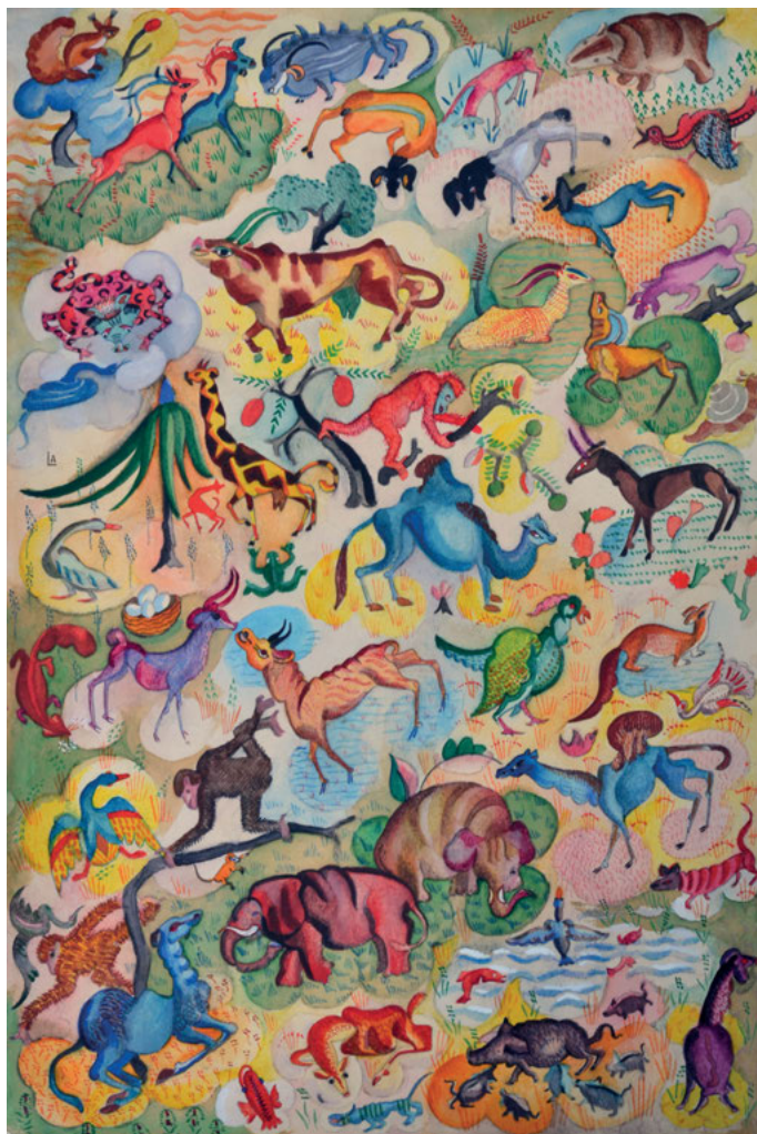
Fig. 4: Anna Lesznai, Animal Fantasy , 1920s.

a bygone era, and Lesznai herself as a “belated modernist” who clung onto ossified forms. However, as will be shown in the following section, it is possible to detect a more “synchronous” side to Lesznai’s work in the post-1918 period – something that has been obscured by teleological art-historical accounts blinkered by periodization norms. In particular, it will be argued that Lesznai’s apparent “belatedness” proves difficult to reconcile with her active involvement,