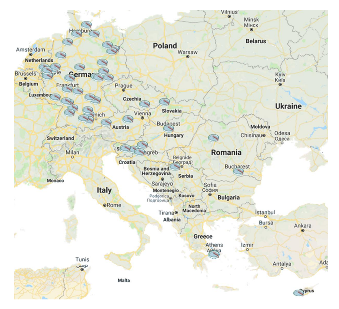
Figure 3. Spatial distribution of the 48 sampled WWTPs. The WWTPs were located in 11 European countries: Germany, Romania, Serbia, Croatia, Slovenia, Hungary, Slovakia, Czechia, Austria, Greece and Cyprus.

2018 [45], whereas the second set of samples included twelve WWTPs in nine DRB countries and was collected during the effluent wastewater sampling campaign of August 2017 in cooperation with the International Commission for the Protection of Danube River [18]. WWTP samples from Athens were collected during the sampling campaign of March 2018, which is one of the biggest WWTPs in Europe [46]. Sampling sites also included the WWTP of Nicosia in Cyprus. Flow-proportional samples were collected in all cases.